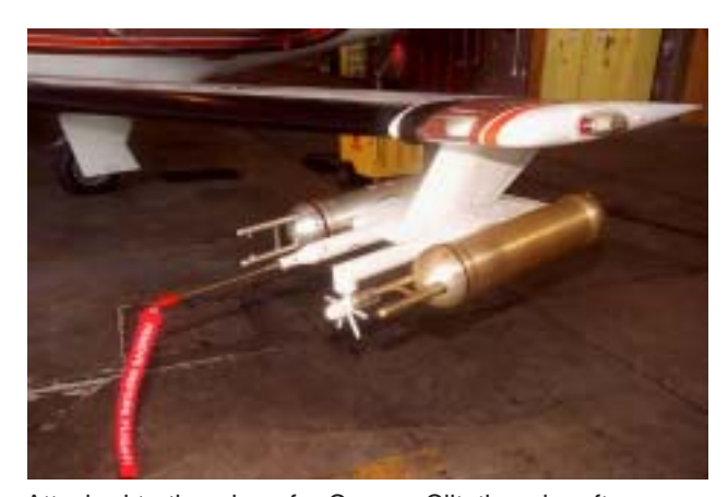
Attached to the wing of a Cessna Ciltation aircraft are cloud physics probes that measure the size, shape and number of ice and water particles in clouds. The plane is also equipped with field mills, used to measure electric fields. The plane is being flown into anvil clouds in the KSC area as part of a study to review and possibly modify lightning launch-commit criteria.

The CGLSS detects, locates and characterizes cloud-to-ground lightning within approximately 60 miles of the RWO. Electromagnetic radiation emitted from lightning is first detected by the system's six direction finder and time-of-arrival antennas, located in Orange and Brevard Counties. Lightning positions are computed using triangulation and time-of-arrival from as many sensors as possible and relayed to a color display video screen in the RWO. Once lightning-producing cells are identified and located, the forecaster can more easily predict just where the next lightning bolts will hit.