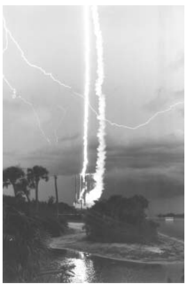
The lightning event begins when lightning strikes the 3,000-foot copper wire being trailed from the 3-foot-tall rocket. The wire is then vaporized as it follows the path to a lightning rod attached to the launcher. As the wire burn dissipates, it creates an effect called irosary bead lightning. This can be the prelude to natural lightning restrikes. The initiation of a wire burn can also induce natural intercloud lightning during the event, as seen in this sequence.

For such a transfer to take place, the two types of charges must be separated so the cloud is electrified. Exactly how the charges become separated and where in the cloud they are located are still not completely clear.