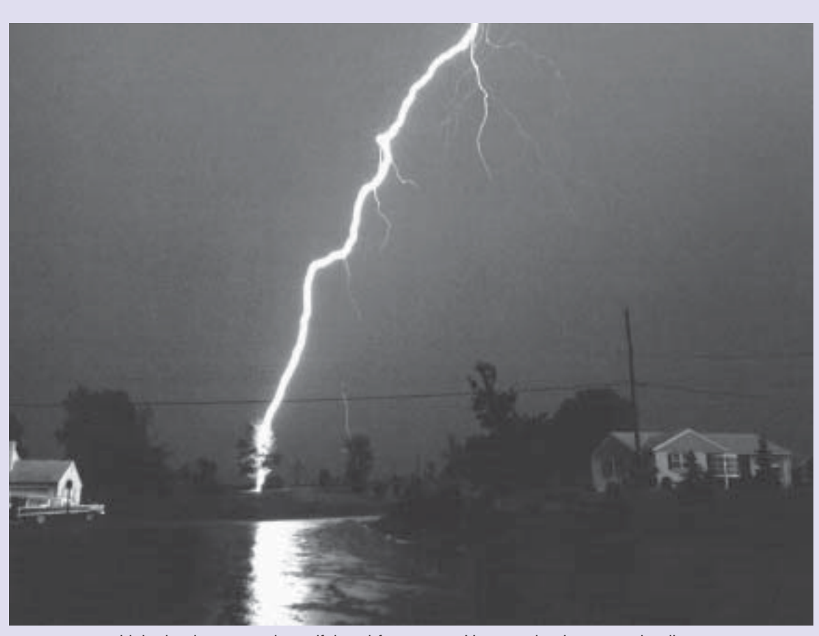
Lightning is at once beautiful and fearsome. Here, a cloud-to-ground strike is caught in the act as it zaps a tree.

Scientists from the University of Arizona, New Mexico Tech and other universities are examining KSC/CCAFS ground-based field mill data for additional clues concerning what condi-