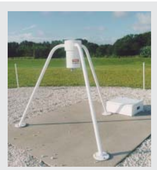
This is one of the 31 electric field mills that compose the Launch Pad Lightning Warning System. They are called mills because they have a rotating, four-bladed shield much like arms of a wind mill. The shield contained in the bottom of the round housing alternately exposes and covers metal sensing plates, resulting in an alternating current proportional to the atmospheric electric field.

The LPLWS comprises 31 electric field mills uniformly distributed throughout KSC and Cape Canaveral. They serve as an early warning system for electrical charges building aloft or approaching as part of a storm system. These instruments are ground-level electric field strength monitors. Information from the LPLWS gives forecasters information on trends in electric field potential and the locations of highly charged clouds capable of supporting natural or triggered lightning. The data are valuable in detecting early storm electrification and the threat of triggered lightning for launch vehicles.