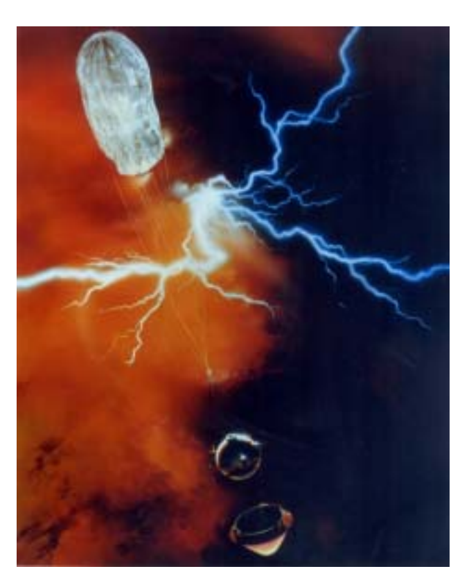
An artist's concept of the descent module of NASAís Galileo interplanetary probe shows the probe plunging through Jupiterís atmosphere. The probe carried instruments designed to investigate lightning in the Jovian atmosphere. Launched from KSC Oct. 18, 1989, Galileo arrived at the planet in 1995, and after 8 years of data gathering, disintegrated as it fell toward the surface.

These giant electric sparks are not unique to Earth. Among the mystifying and gargantuan storms that rage throughout Jupiter's atmosphere, one familiar phenomenon – lightning – was captured by cameras on NASA's Voyager I