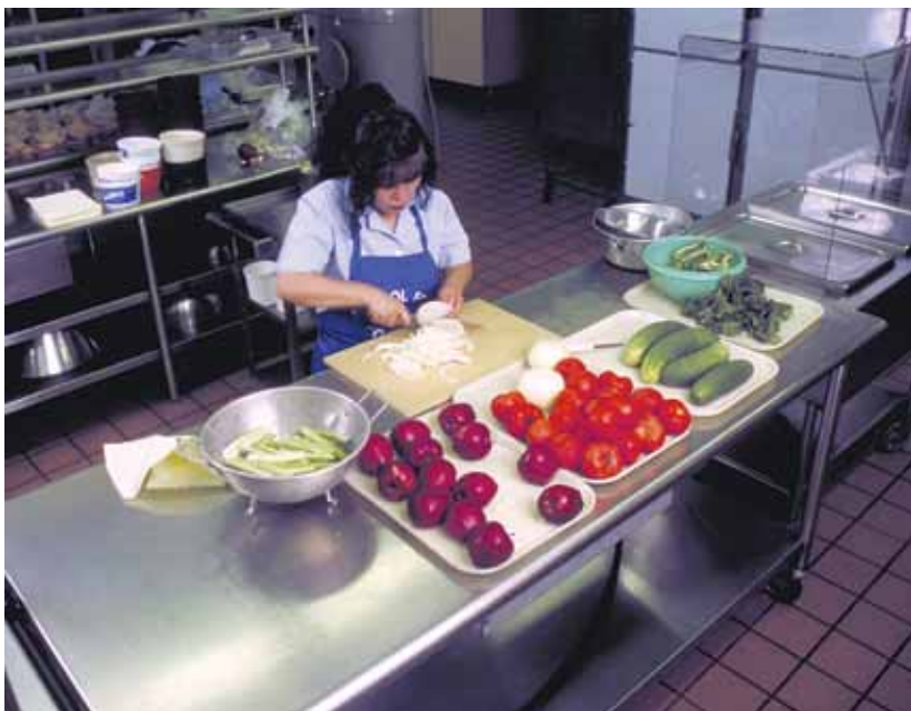
"Farm-to-school" programs and other strategies that incorporate fresh and local produce into school meals may not only increase participation in school meals and consumption of salads and other vegetables but may also decrease plate waste.

The presence of competing food options may decrease the likelihood that a child will purchase the USDA school meal, but, for those who continue to participate in the meal program, competing foods could also affect plate waste. For example, a child could choose a federally reimbursed school lunch but also purchase additional foods, such as snack or dessert items, from competitive sources and fail to completely consume the school lunch because part of it was replaced by the competing item. In such cases, plate waste would not represent a loss of calories but rather a substitution of items of differing calorie and nutrient profiles. In the future, it may be necessary to assess the role of competing food options in children's school meal choices to fully understand the nutritional significance of plate waste.