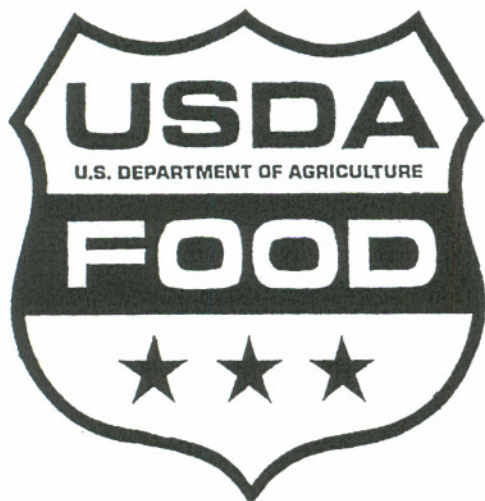
Exhibit 2 Alternative Label for Shipping Containers (Includes all Required Information)