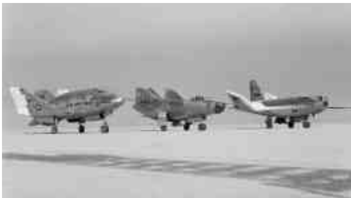
Three lifting bodies on the lakebed (X-24A, M2-F3, HL-10).

Five heavyweight designs were flown at Dryden from 1966 to 1975. They were the M2-F2, M2-F3 (rebuilt from the M2-F2 following a landing accident), HL-10, X-24A, and X-24B (rebuilt from the X-24A in a new configuration).