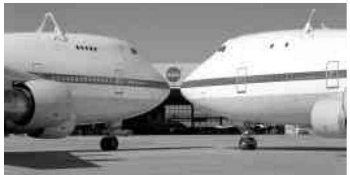
The two shuttle carrier aircraft, nose-to-nose.

The SCA is now the standard ferry vehicle.