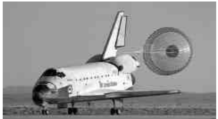
The space shuttle Atlantis lands with its drag chute deployed on Runway 22 at Edwards, Calif., to complete the STS-66 mission.

Rosamond Dry Lake at Edwards Air Force Base also has two lakebed runways available for special landings, if needed.