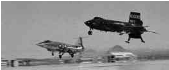
X-15 #3 and F-104A chase plane landing.

Using three research vehicles (one was lost in an accident late in the program), 12 pilots assigned to the program at the Flight Research Center collected a wealth of data between 1959 and 1968 on 199 research flights. Much of this information fanned out across the aerospace industry and has been applied to commercial and military aircraft and to the nation's space programs.