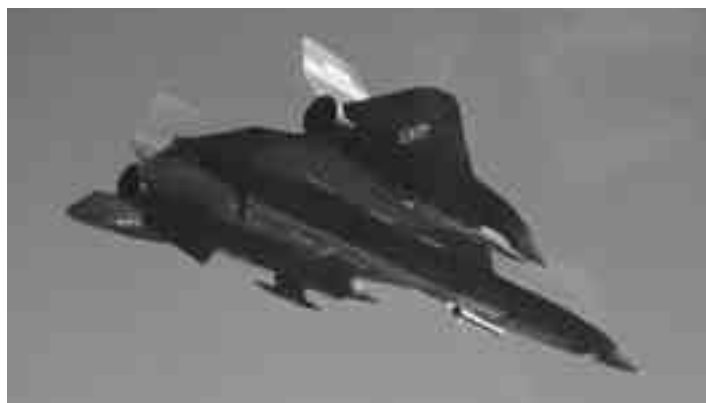
YF-12A in flight with "cold wall" experiment.

In 1972, Dryden began research flights with the first aircraft equipped with an all-electric, digital flight control system. This was the F-8 Digital Fly-By-Wire, which used electrical impulses instead of mechanical means to link cockpit controls and actuators moving the rudder, elevators, and ailerons. This same all-electric F-8 was used to test and verify the computer hardware and software used in the space shuttle's flight control system before the first orbital flights began.