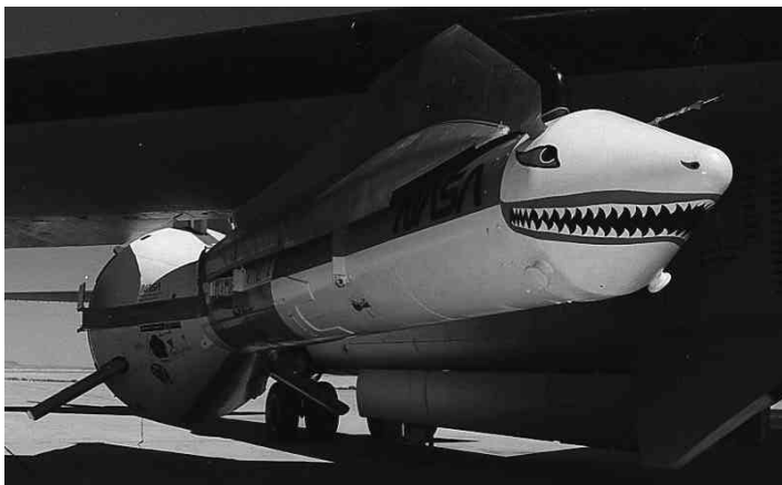
Simulated (smaller) version of the shuttle's solid rocket booster under the wing of the B-52.

The tests, using a dummy solid rocket booster, verified the performance and reliability of the parachute recovery system used now to recover the solid rocket booster casings after they separate from the shuttles' external fuel tank during launch operations. The booster casings are refurbished for reuse after they are retrieved from the ocean.