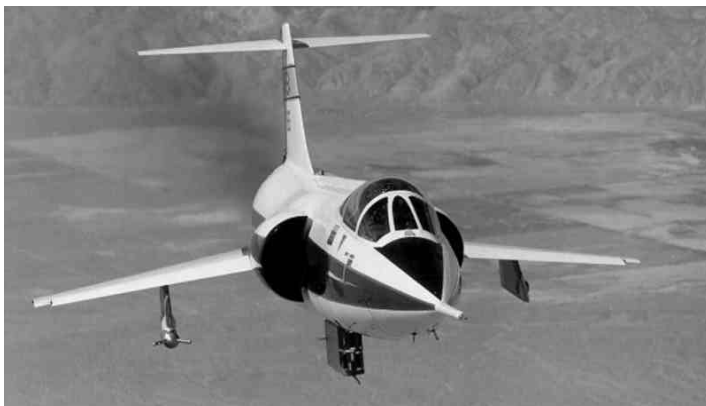
F-104 engaged in shuttle tile research.

In 1980, Dryden research pilots flew 60 flights to test space shuttle thermal protection tiles under various aerodynamic load conditions.