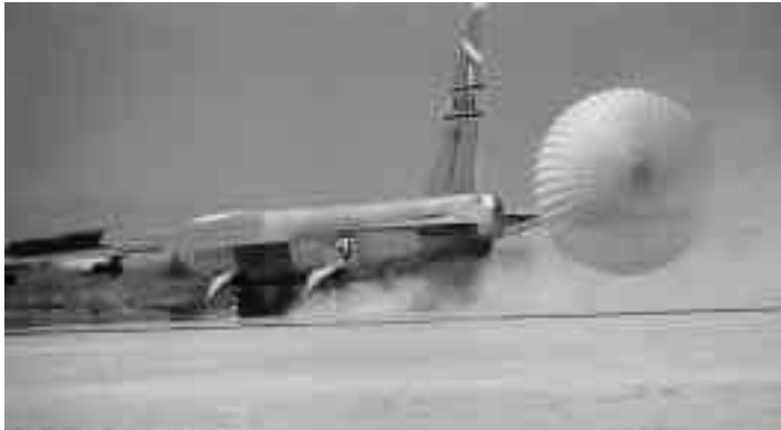
B-52 testing developmental space shuttle drag chute.

A series of eight drag chute deployment tests were carried out, with the B-52 landing at speeds ranging from 160 to 230 miles per hour on a lakebed runway and also on the main 15,000 foot concrete runway at Edwards.