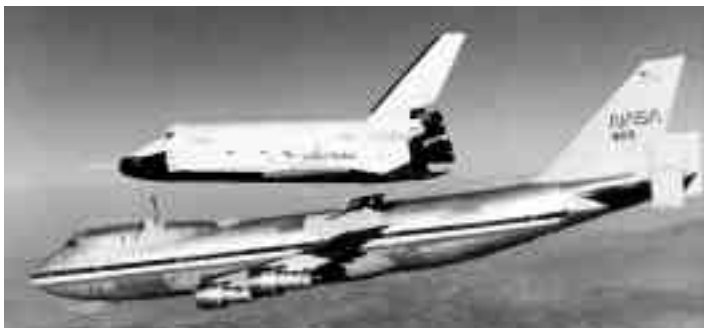
Enterprise separates from 747 SCA for first tailcone off free flight.

Four of the free flight landings were made on Rogers Dry Lake at Edwards. The final free flight landing was on the main 15,000-foot concrete runway at Edwards.