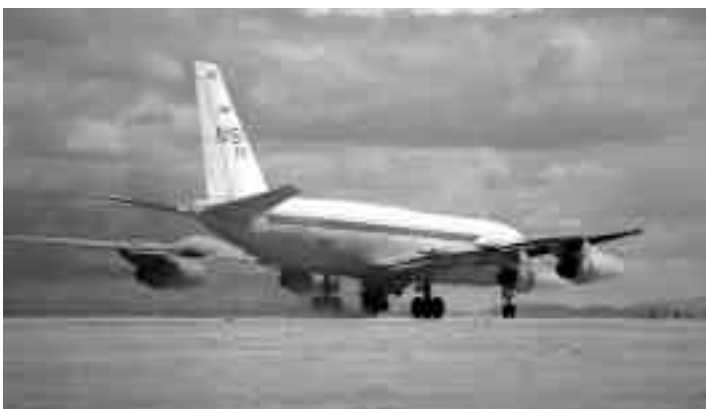
CV-990 Landing Systems Research Aircraft.

The CV-990, modified at Dryden and operated by Dryden personnel, had a landing gear retraction system installed in the lower fuselage between the aircraft's main landing gear. During tests, the shuttle test component was lowered once the aircraft's main landing gear had contacted the runway. This allowed much higher speeds and loading than the