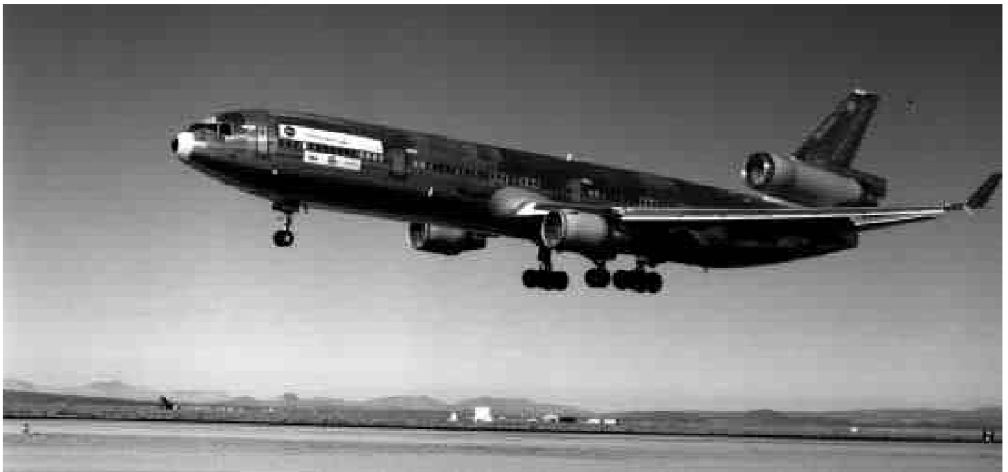
Propulsion-Controlled Landing with MD-11