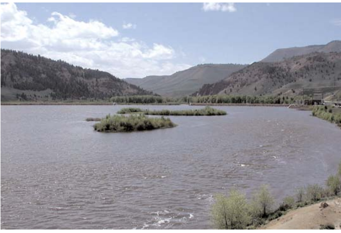
Existing Windy Gap Reservoir

After conveyance and evaporation losses and allocations to the Middle Park Water Conservancy District, the average annual deliveries to the allotees of the Windy Gap Project were estimated to be about 48,000 acre-feet. Each unit (100 acre-feet/unit) of Windy Gap water is 1/480th of the