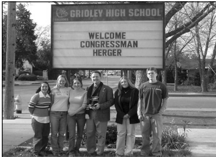
During a recent visit to Gridley High School, students meet with Congressman Herger and discuss national issues of importance to northern California.

Rising health costs affect everyone, not just se-