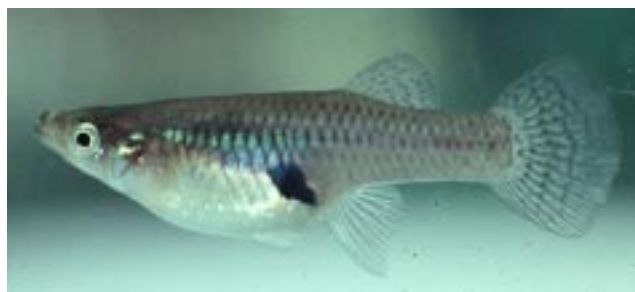
Female Eastern Mosquitofish

Studies conducted on Everglades wetland ecology advance the understanding of the ecological structure and function of this large, freshwater marsh system, but also have wider implications for comparison with other tropical and sub-tropical wetlands worldwide. Such systems have received little descriptive or experimental study, despite providing vital regional and local functions for water supply, wildlife and fishery habitat, etc. In view of the human activities that threaten to degrade many freshwater wetlands, it is critical to understand their ecological function and how that might be restored after damage has occurred. Lessons learned from this project in the Everglades may provide information, sampling guidelines, and models for other wetland systems.