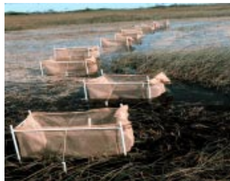
Experimental cages in the Everglades

The USGS Florida Caribbean Science Center's Restoration Ecology Branch staff at the Everglades National Park conducts integrated studies of the ecology of South Florida's wetland fauna in partnership with local agencies and universities. Understanding the wetland communities and their responses to the environment is critical to the scientific management and restoration of these imperiled systems.