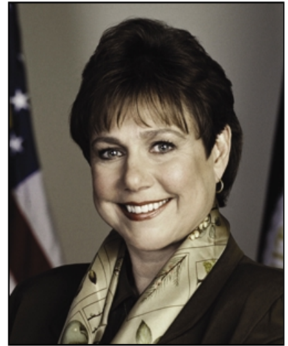
Ann Veneman, Secretary of Agriculture

"One of the President's top priorities is to create new jobs and help spark economic growth. The tax relief package that the President signed into law in 2001 continues to help families throughout America and USDA's Rural Development programs are also creating new opportunities. In 2002, for example, economic grants and loans provided by USDA helped create or protect more than 150,000 rural jobs. As well, Rural Development programs provided more than $12 billion in economic infrastructure grants and loans, helping improve education, healthcare, telecommunications, water treatment facilities, fire protection efforts, and other community centers."