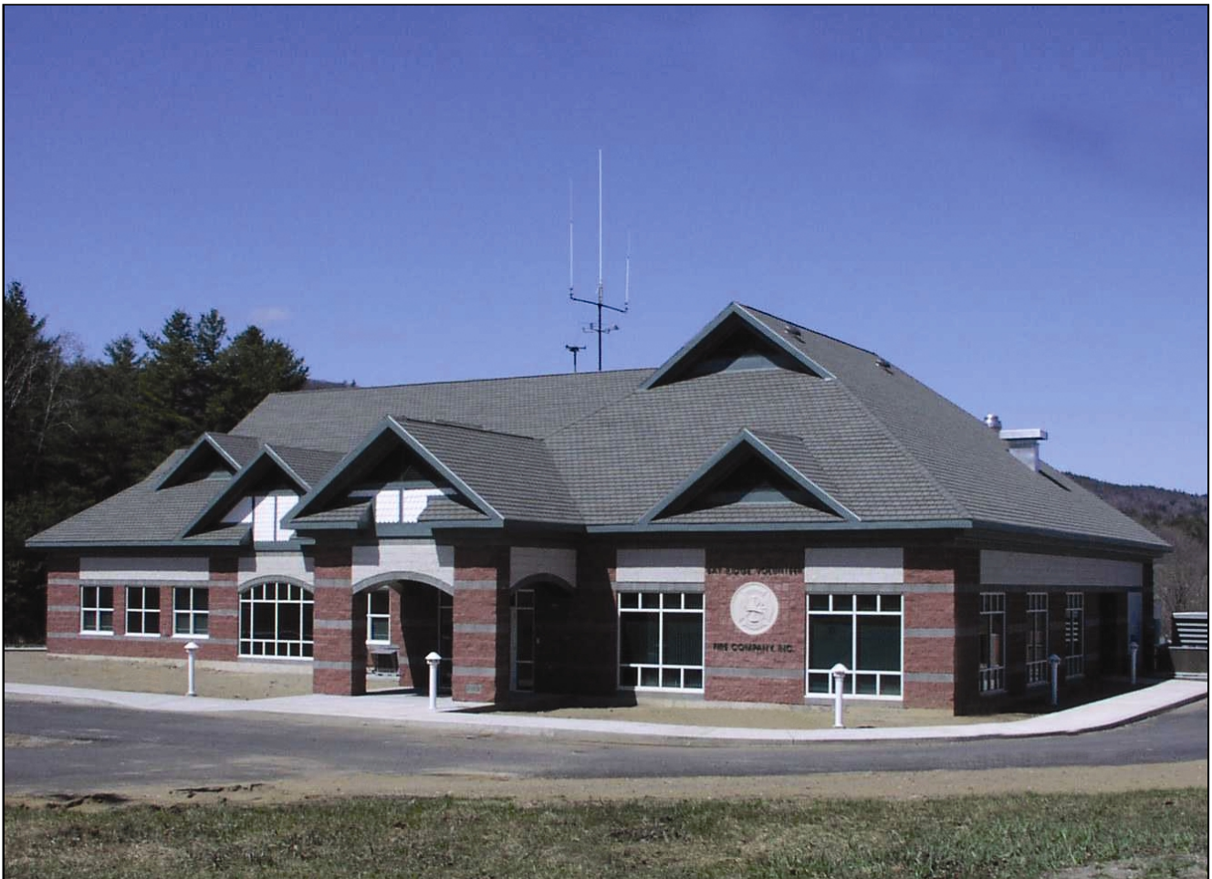
Bay Ridge Volunteer Fire Company, Inc., Queensbury, NY (Warren County), a Community Facilities Guaranteed Loan recipient.