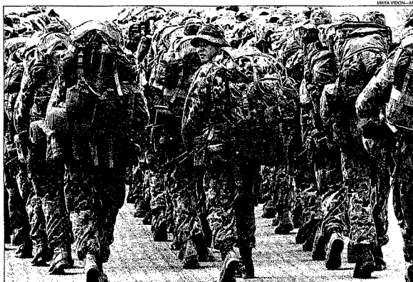
G'day, mate: Australian soldiers will lead the U.N.-authorized peacekeeping force.