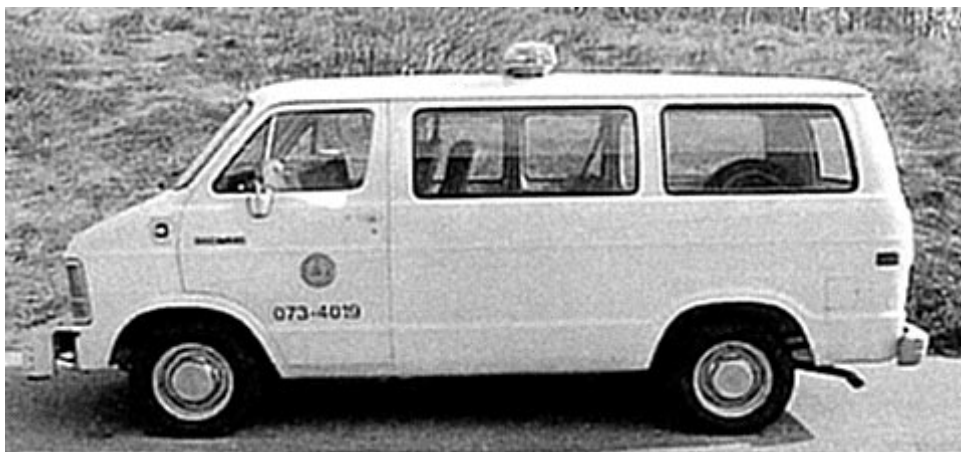
Figure 1: Profiler Vehicle

Height sensors mounted in the front bumper of this Pennsylvania Department of Transportation road profiler send pavement data to an onboard computer for calculating the International Roughness Index.