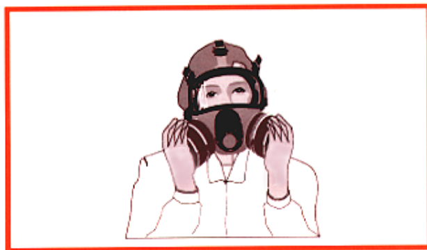
User Seal Check: worker covering inlet and inhaling (negative pressure check)

A: Yes, employees using tight-fitting facepiece respirators are required to perform a user seal check each time they put on the respirator using the procedures in Appendix B-1 of 29 CFR 1910.134 or procedures recommended by the respirator manufacturer that the employer demonstrates are as effective as OSHA's procedures. Note that a fit test is a method used to select the right size respirator for the user. A user seal check is a method to check to see if the user has correctly put on the respirator and adjusted it to fit properly, as illustrated below.