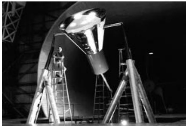
NASA Langley Research Center photo #59-336 A full-scale model of the Mercury capsule being tested in the NASA Langley 30- by 60-Foot Full-Scale Wind Tunnel.

The Big Joe program involved ballistic tests of a Mercury capsule on an Atlas missile. Big Joe was a one-ton, full-scale instrumented mock-up of the proposed Mercury spacecraft, designed to test the effectiveness of the ablative heat shield and the aerodynamic characteristics of the capsule design. Big Joe was successfully launched on Sept. 9, 1959. The Big Joe project, from design to launch, was