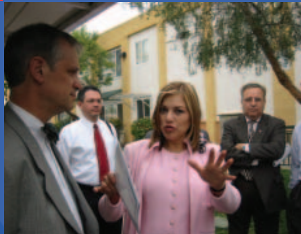
Loretta is joined by noted community livability expert, Congressman Earl Blumenauer of Oregon, on a tour of Santa Ana's Minnie Street neighborhood.

Congresswoman Loretta Sanchez U.S. House of Representatives 12397 Lewis Street, Suite 101, Garden Grove, CA 92840