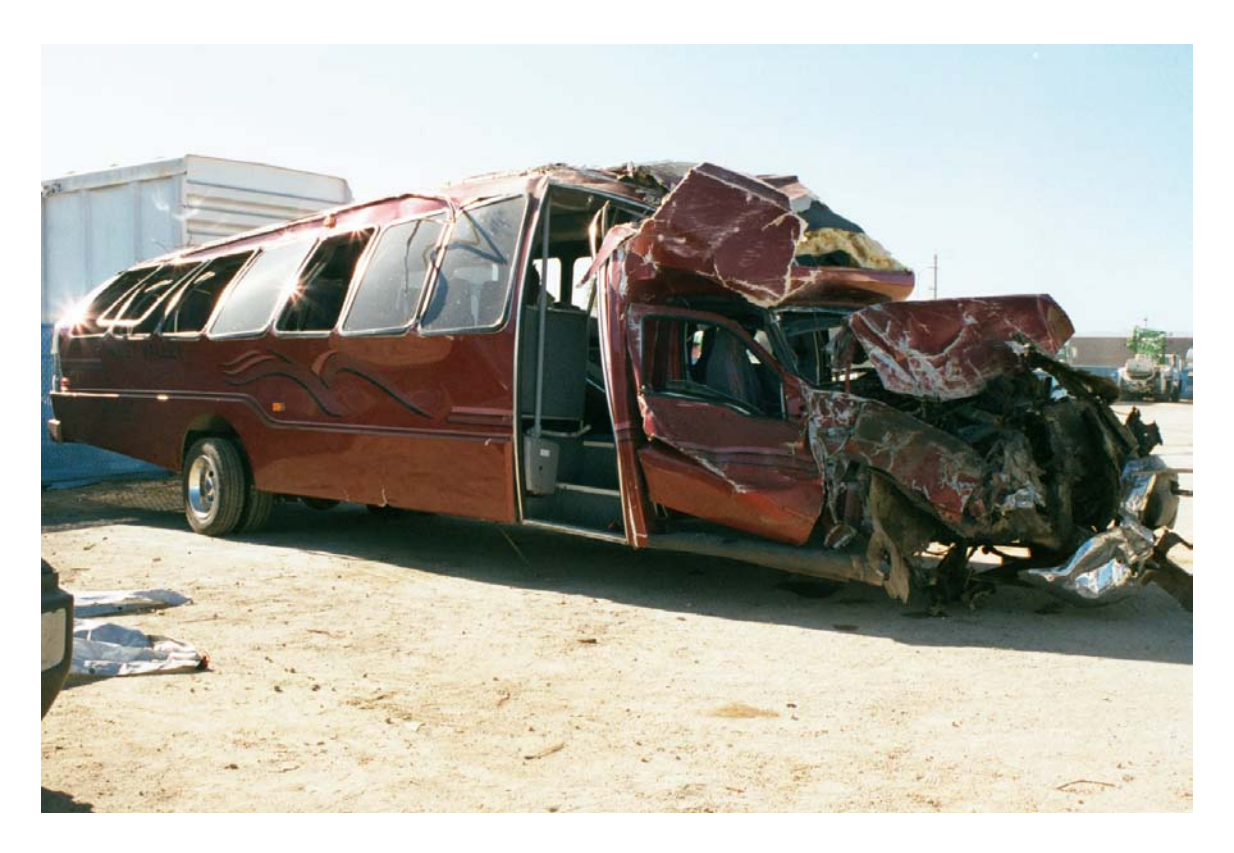
Figure 2. Body damage to nonconforming bus involved in San Miguel accident.

For its 1999 special investigation of nonconforming buses,<sup>3</sup> the Safety Board investigated four accidents. Nine people were killed and 36 were injured in these collisions. Most of the victims, including the eight fatalities, were children.