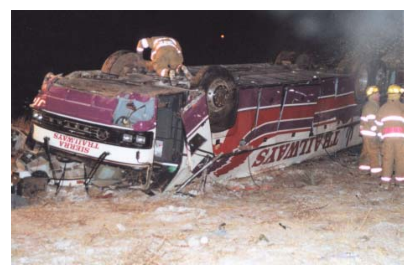
Figure 1. Photograph of motorcoach at final rest position.