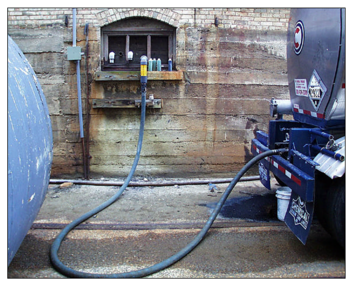
Figure 1. Postaccident view of the cargo tank (right) with transfer hose attached to the ferrous sulfate transfer coupler. The two pipes seen at the left of the ferrous sulfate coupling are no longer used and do not have couplers attached.

The shift supervisor showed the driver the ferrous sulfate connection (the only working transfer connection at that location) so he could deliver his product. (See figure 1.) The shift supervisor then unlocked a gate to allow the driver to bring his vehicle onto the plant property. The driver asked the supervisor to sign the shipping documents so he would not have to find the supervisor after the transfer was completed. According to the supervisor, he signed the paperwork without reading it and left the area. The signature block that the supervisor signed stated the following: "I have checked the documents for this shipment and verify that there is adequate storage room to receive this shipment and connection has been made to the proper storage facility."