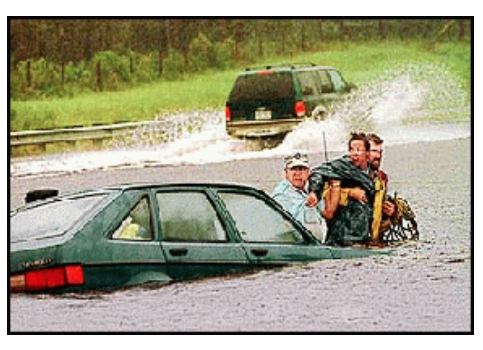
In an average year, more than 130 people are killed by flooding and flash flooding.

When and where to evacuate people, goods and industrial property from potential flood areas, thus saving more lives and contributing to economic savings