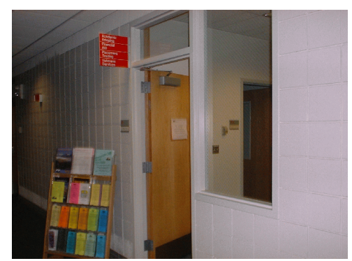
Advising and Assessment Center FSM 102