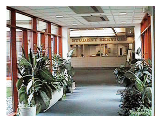
Admissions & Records Office FSM 101

http://www.matsu.alaska.edu/Students/advis_and_assess.htm