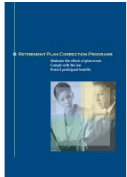
The new Retirement Plan Correction Programs pamphlet gives an overview of IRS, DOL and PBGC programs.

Finally, EP has posted an Online Version of the materials (minus video clips) on the Retirement Plans Correction Program CD-ROM . Go to the Retirement Plans web page at www.irs.gov/ep , select “More Topics” and go to “Correction”. This tool is an excellent place for both plan sponsors and practitioners to find the latest information on the correction programs plus have ready access to the information on the CD-ROM. •