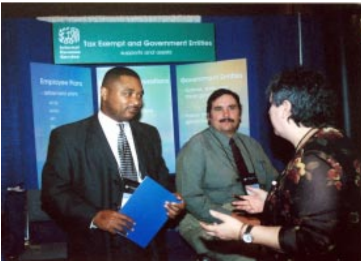
TE/GE Staff were available at each of the IRS Nationwide Tax Forums to answer questions and hand out related materials.

Exempt Organizations (EO) presented sessions entitled "Introduction to Exempt Organizations" and "Do's and Don'ts for Churches and Religious Organizations". They also offered a workshop entitled "Applying for Tax-Exempt Status". The EO sessions were also very well attended – so much so that by the time the last forum came around, the workshop was expanded from one session to four.