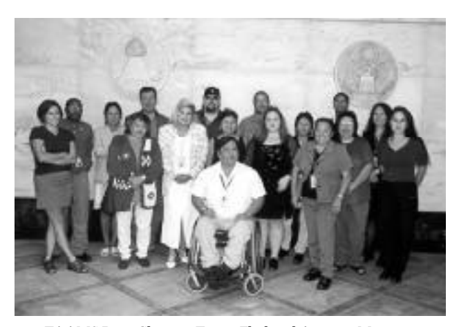
TAAMS Data Cleanup Team, Flathead Agency, Montana

cial, contractor-owned and operated Trust Fund Accounting System. In April, 2000, the Office of the Special Trustee completed conversion of the 285,000 tribal and individual accounts to TFAS, which will ensure that account holders receive timely and accurate receipt, accounting, investment, scheduled disbursements, and reports - functions that are common to commercial trust funds management systems. The BIA is also in the process of replacing its obsolete and inadequate land records system with a new, state-of-the-art asset management system. This new Trust Asset and Accounting Management System will help ensure that all revenues due are collected in a timely manner and will track the land title, lease, billing, and accounts receivable information for improved asset management.