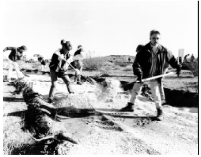
Volunteers build a trail adjacent to a wetlands in the new Boulder City, Nevada, Veterans Memorial Park. The wetlands is being created by Reclamation, City of Boulder City, and Nevada Department of Wildlife.