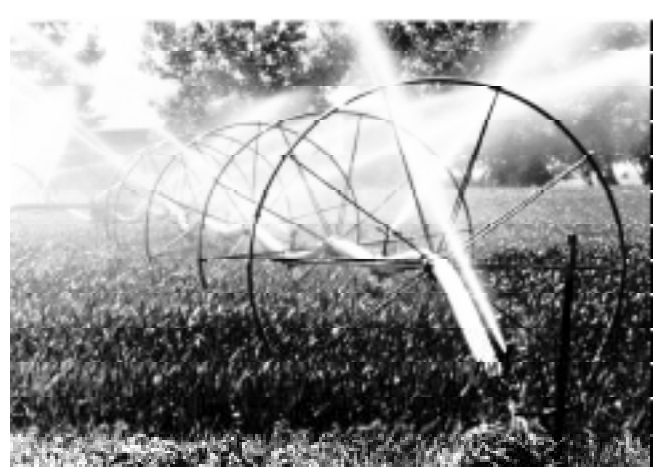
Irrigation in eastern Washington's Columbia Basin Project is an economic mainstay for the region.

The 1996 drought in the Southwest was the worst in 25 years. In response to this and recurring droughts throughout western history, Reclamation joined the Western Governors Association and other governmental agencies to form a Drought Policy Commission Group. The group's purpose is threefold: to improve Federal assistance to affected States; to work with State, Federal, and private entities in developing drought assessment criteria and response assistance; and to share solutions and relief measures throughout the West. To date, Reclamation has supported this effort by providing funding, key personnel to serve on the coordination group, and technical and design assistance preparing a drought response action plan.