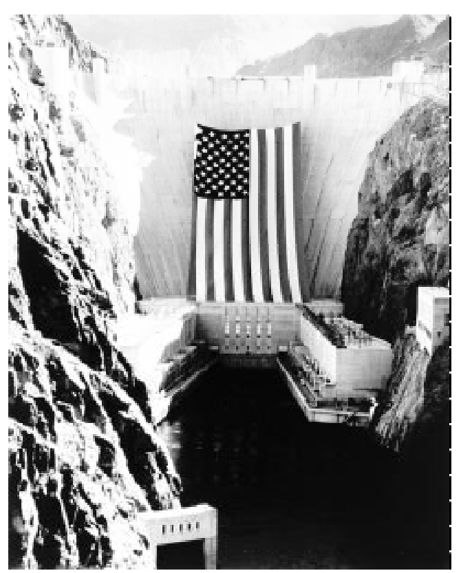
A 505-foot long, 255-foot wide, 3,000-pound American flag "flies" from the face of Hoover Dam on May 1, 1996, as part of the ceremonies surrounding the arrival of the Olympic torch as it crossed America prior to the 1996 Olympic Games in Atlanta.

participation in the international marketplace; and obtaining improved technology for the benefit of Reclamation water users and the United States through reimbursable technical assistance, technical cooperation and technology exchange, and training foreign governments. Reclamation also continued to assist the Secretary with his responsibility for administrating U.S. territories and commonwealths by providing technical assistance in the Virgin Islands.