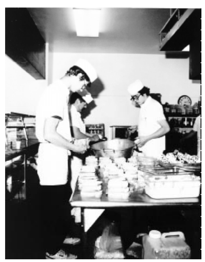
Culinary arts program students at the Fort Simco Job Corps Center, which Reclamation administers under an interagency agreement with the Department of Labor.

This aggressive effort established benchmarks and compared Reclamation's performance internally and with industry leaders. In this analysis, Reclamation