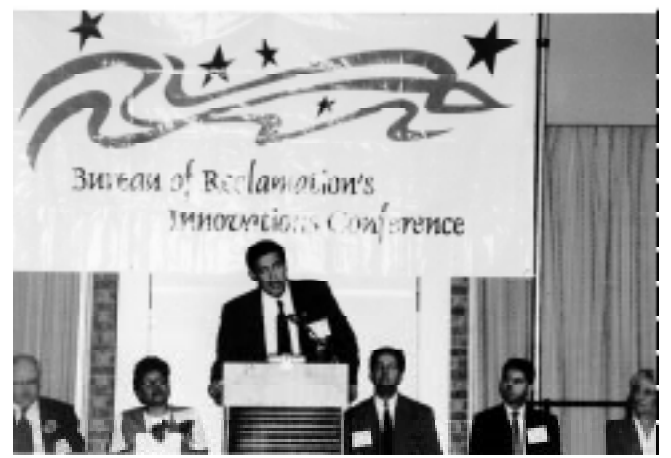
Reclamation Commissioner Eluid Martinez addresses the plenary session at Reclamation's third Innovations Conference in San Antonio, Texas.

In 1996, Reclamation published a final environmental impact statement on ways to implement the acreage limitation and water conservation provisions of the Reclamation Reform Act of 1982 (RRA). Revised rules, reflecting the document's preferred alternative and responding to public comment, were published in December 1996. One major change reduced the paperwork burden on many landholders by raising the acreage threshold for submitting annual forms to receive Federal project irrigation water. Reclamation also rewrote and reorganized the rules and RRA forms to make them clearer and less burdensome to the public, estimating that the total number of forms submitted and burden hours on the public will be reduced by 22 percent. Reclamation also chose to implement conservation plan requirements for districts through a new cooperative field services program rather than increased regulation.