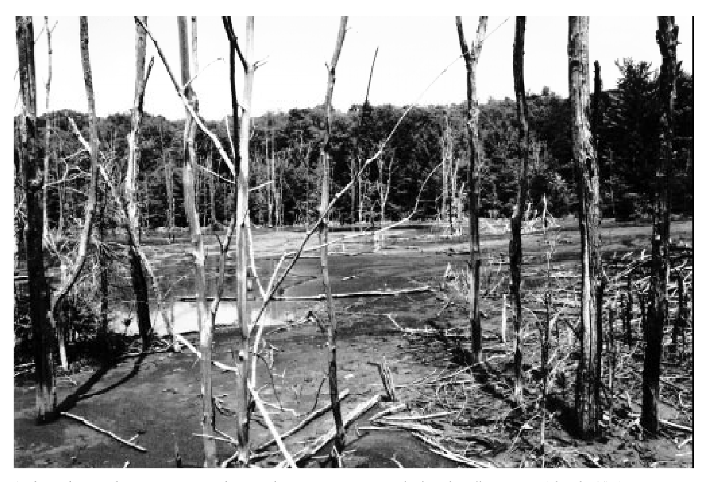
Acid mine drainage destroys vegetation and impacts downstream areas many miles from the pollution source.

Northern California from 1994 to 1996. The plan has helped streamline the Section 7 consultation process of the Endangered Species Act, reducing average consultation from 135 days to 35 days and promoted the establishment and signing of Habitat Conservation Plans to find habitat solutions that are biologically and economically feasible to State, local, and private landowners. In addition, four Adaptive Management Areas have been developed to demonstrate new ways to integrate ecological and economic objectives, and establish a comprehensive system of old growth preserves.