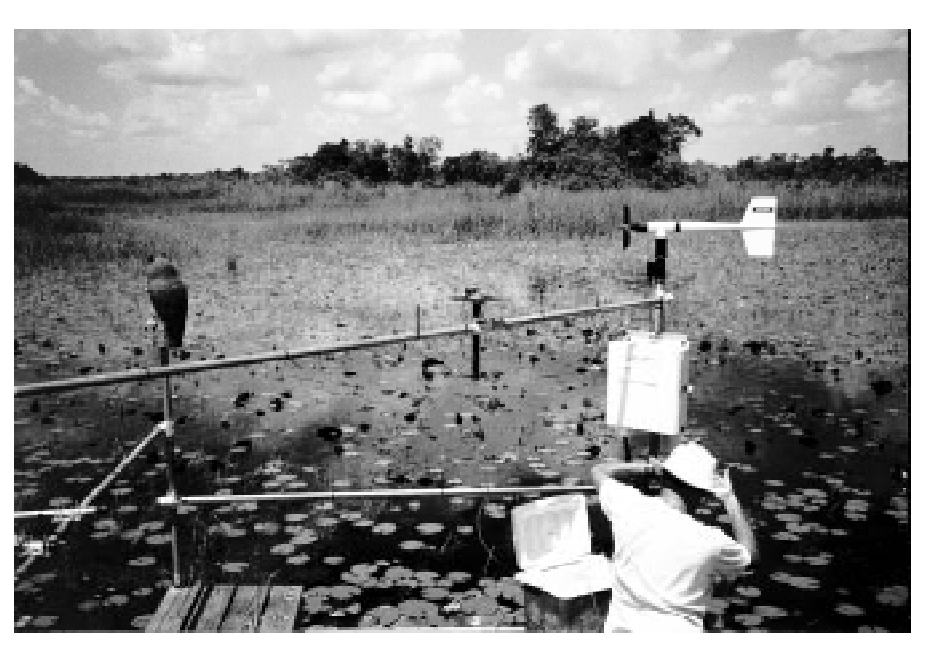
Fieldwork in the Everglades.

The restoration of the Everglades and the South Florida ecosystem continues to be a critical environmental