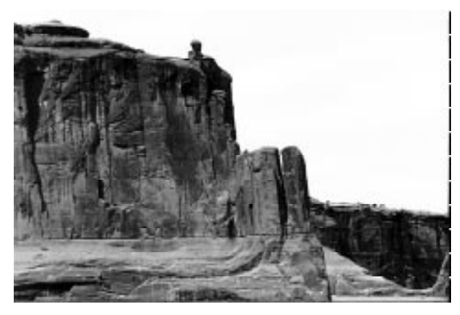
Arches National Park.

The Fish and Wildlife Service is charged with conserving, protecting and enhancing fish and wildlife,