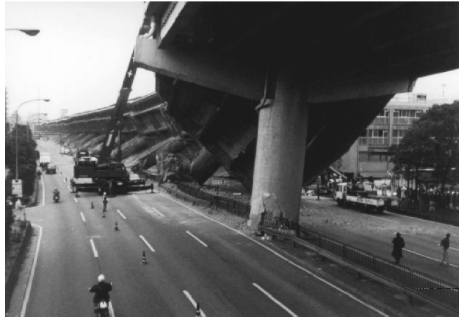
Damage from the Kobe earthquake.

Total DOI Budget Authority - $9,744 million