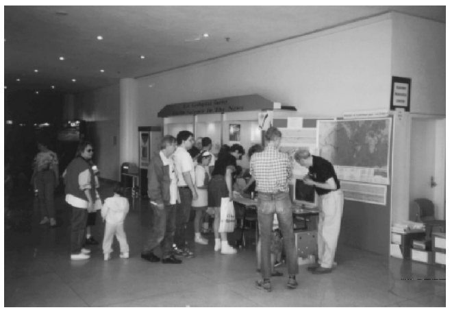
Science Day at USGS National Center (April 29, 1995).

The Geological Survey's National Water-Quality Assessment (NAWQA) Program seeks to describe the quality of the Nation's ground-water and surface-water resources, determine if there are any statistically significant trends in that quality, and to describe, whenever possible, the human and natural factors that have caused those trends. The linkage of water quality to environmental processes is of fundamental importance to water-resource managers, planners, and policy makers. The NAWQA program's unique design provides consistent and comparable information on water resources in 60 important river basins and aquifers across the Nation. Together, these areas account for 60 to 70 percent of the Nation's water use and population served by public water supplies and cover about one-half of the land area of the Nation. Investigations of these 60 areas, referred to as