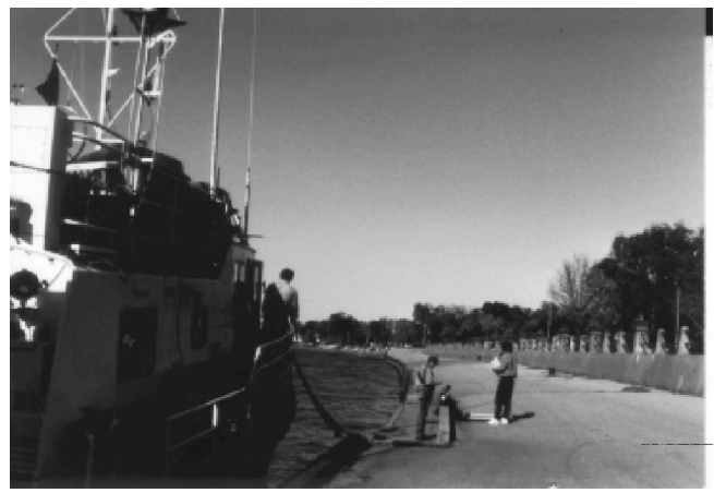
USGS research vessel on the Upper Mississippi River.

In February 1995, the Geological Survey completed a new national assessment of United States oil and gas resources, including both conventional and unconventional resources. The results of the assessment were released as an interactive CD-ROM with an accompanying full-color publication describing the methodology, data, and results. These products are being used by State and Federal land-management agencies, economic and utility analysts, natural gas and oil producers, and earth-science and economics educators to make decisions regarding competing land-use scenarios, to perform economic projections of national and international trade, to develop strategies for discovering new oil and gas reserves, and to educate the Nation's future scientists and economists. This