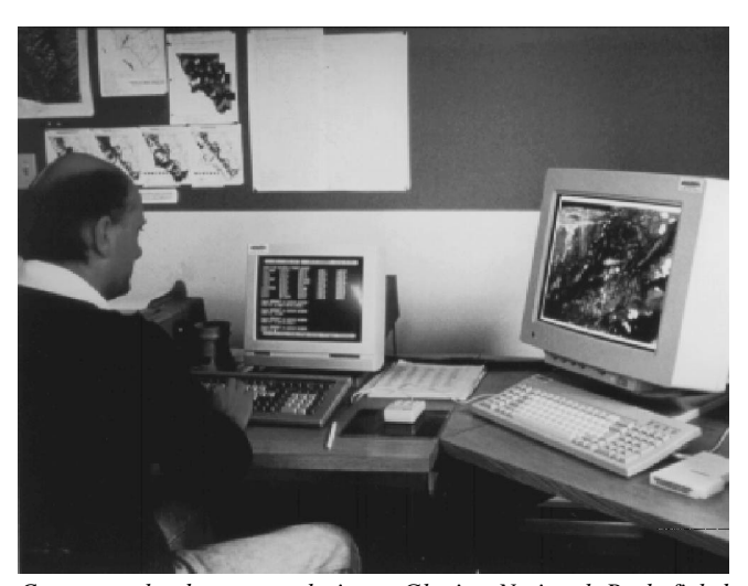
Computer landscape analysis at Glacier National Park fiel d station.

For example, the Biological Service offers the best scientific advice on waterfowl populations. The Biological Service scientists are experts in population monitoring, data management, reproductive and nesting success, effects of predators, habitat restoration, and wildlife disease. These experts can -- and do -- apply this expertise across the United States, as well as Canada and Mexico, where many ducks and geese breed and winter. State, Federal, and international waterfowl managers use this critical science, knowing that the Biological Service has no stake in a particular management decision. But it is citizens -- including both hunters and bird watchers -- who benefit from healthy flights of migratory waterfowl.