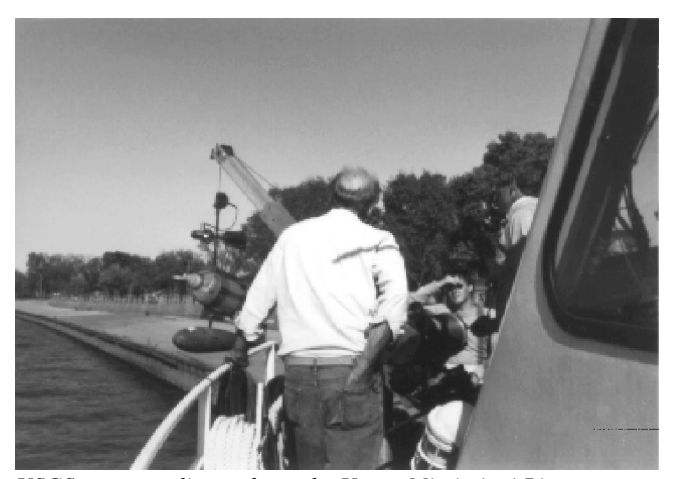
USGS water quality study on the Upper Mississippi River.

damage could have been much worse. The Geological Survey activities to record regional earthquake patterns, map the geology of the Los Angeles basin, and calculate the strength of future ground motions formed the basis in southern California for some of the country's most stringent building codes.