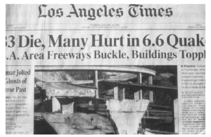
Los Angeles Times article on the Northridge earthquake.

It only took 10 to 20 seconds of strong ground shaking on January 17, 1994, to collapse buildings, bring down freeway interchanges, and rupture gas lines in the Los Angeles area. The Northridge earthquake, although moderate in size, caused about $30 billion in damage; but