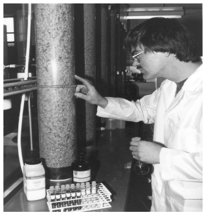
The USBM collected, analyzed, and disseminated information about the mining and processing of more than 100 mineral commodities across the Nation and in more than 185 countries around the world.

As environmental concerns increased, the Bureau of Mines applied its expertise to mine-related problems and developed improved mine reclamation and remediation technologies, constructed wetlands to mitigate acid mine drainage, and found ways to remove selenium, arsenic, and lead from polluted waters. The Bureau has assisted the land management agencies in dealing with abandoned mines and mineral processing sites, helped the Department of Defense remove lead from soils around firing ranges, and helped the Department of Energy find new ways to