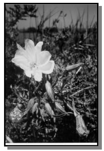
Antioch Dunes evening primrose

If you have concerns, comments, or suggestions concerning the Antioch Dunes National Wildlife Refuge, please send them to us in writing. Our address is at the end of this