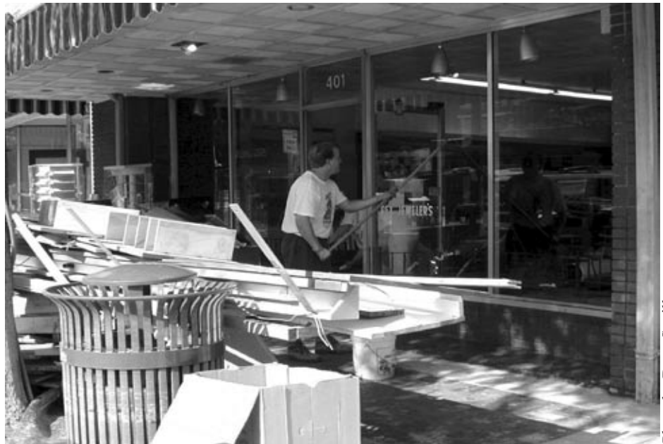
A river flooded as a result of a hurricane and caused major damage to the business district.

Most emergency shelters will not accept pets. In the event of evacuation, make alternative arrangements for pets, such as with family friends, veterinarians or kennels in safe locations. Send medicine, food, feeding information and other supplies with them.