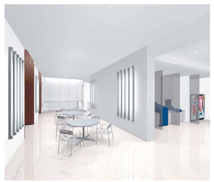
The new Café and Business Center provides an expanded snack stand, consolidated vending and mailing services, and new seating areas for building tenants and visitors.

The success of GSA First Impressions projects at the U.S. Courthouse, along with the ongoing renovations at the Federal Building, is helping the federal workforce in Philadelphia serve the public in a welcoming and professional environment. □