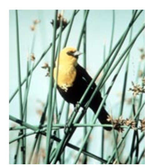
Yellow-headed blackbird (mature male).

A robin-sized bird, the male yellowhead has a black body with a conspicuous yellow head and breast and a white wing patch seen only when the bird is in flight. The female is smaller and browner with yellow throat and breast and does not have a white wing patch. Yellowheads are locally abundant nesters in deep-water marshes of the northern Great Plains and western North America. Like redwings, male yellowheads often mate with more than one female. This species feeds extensively on insects during the nesting season and in late summer and fall on weed