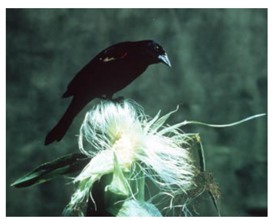
Red-winged blackbird (immature male) on an ear of corn.

Red-winged blackbirds are the most numerous breeding blackbird in the Dakotas and Minnesota and perhaps the most abundant bird in North America. The male, a little smaller than a robin, is black with red and yellow shoulder patches. The brownish female, which is smaller than the male. is often mistaken for a large sparrow. Redwings nest throughout North America in marshes, havfields, and ditches. Often adult males mate with more than one female. Insects are the dominant food during the nesting season (May-July), with the diet shifting to predominantly grain crops and weed seeds in late summer through winter. Redwings from the Dakotas and Minnesota migrate to the lower Great Plains and gulf coast region in winter.