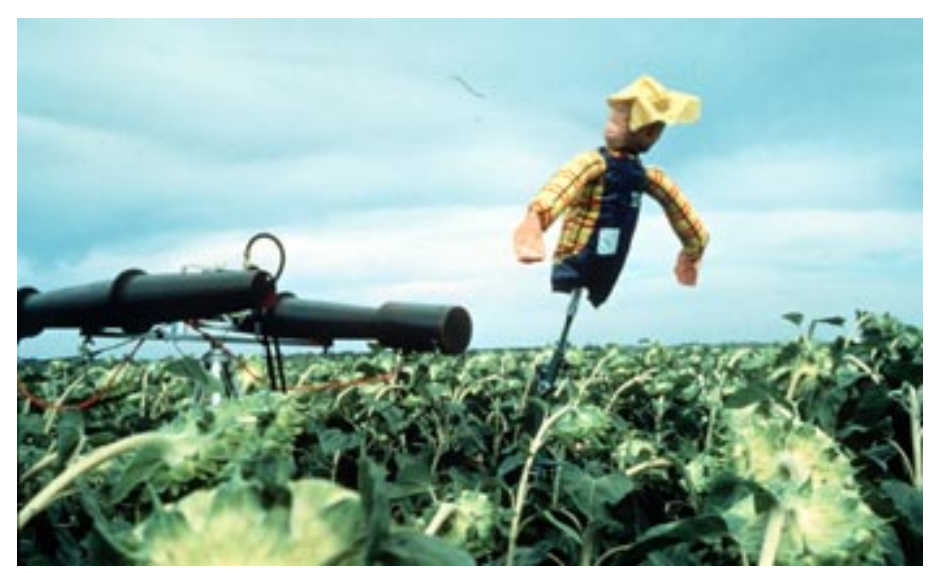
A propane exploder and a popup scarecrow powered by carbon dioxide.

devices mandates that farmers persistently scare the birds before their feeding patterns become well established. Devices need to be employed especially in the early morning and in late