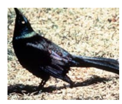
Common grackle (mature male).

Common grackles are slightly larger than robins, with iridescent black feathers and a long keel-shaped tail. The male, slightly larger than the female, has more iridescence on the head and throat. Grackles are common nesters throughout North America east of the Rockies, nesting in shelterbelts, farmyards, marshes, and towns. The male grackle usually mates with one female. Flocks feed in fields, lawns, woodlots,