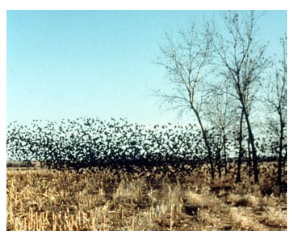
Blackbirds often use alternate feeding sites when available.

In late summer, after the nesting season, blackbirds form flocks and roost at night in numbers varying from a few to over a million birds. These flocks and roosting congregations are sometimes comprised of a single species, but often all three species mix together. Although some blackbirds roost in trees in the northern Great Plains, the birds prefer to roost in dense cattail marshes. Between 40 and 50 percent of the blackbird population dies every year. But these mortality figures are offset by the birds'