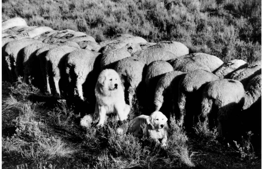
These guarding dogs, a Great Pyrenees and an Akbash dog, stay close to the flock, causing no harm to the sheep but aggressively repelling predators.

Success may be enhanced by viewing a livestock guarding dog as a tool to be incorporated into the overall management of a sheep operation. Dogs do not perform automatically like a piece of machinery, and their behavior is variable. Producers who successfully use a dog may need to slightly alter their management routine to take advantage of the traits of the dog. This may include grazing sheep in different pastures, separating or grouping sheep,