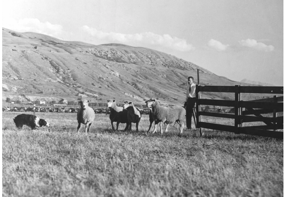
These sheep are responding to the herding actions of this border collie.

Unrestrained nonworking dogs are found on many farms and ranches. These dogs can present a problem to a guarding pup that is being trained to protect the flock. They are a source of distraction and at worst can involve the pup in learning inappropriate behaviors. In some instances a choice has to be made between rearing a good guarding dog and having unrestrained pets.