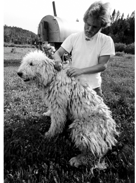
As demonstrated by this dog handler separating mats of hair, the coat of the Komondor requires special care and attention.

Although a guarding dog may provide up to 10 years of productive service, there is a reasonable chance the dog will die prematurely. During a 5-year period of study at the USSS, 32 percent of the working guard dogs died before reaching adulthood. The major causes of death were as follows: hit by vehicle, 23 percent; maliciously shot, 23 percent; health problems, 18 percent; accident in field, 9 percent;