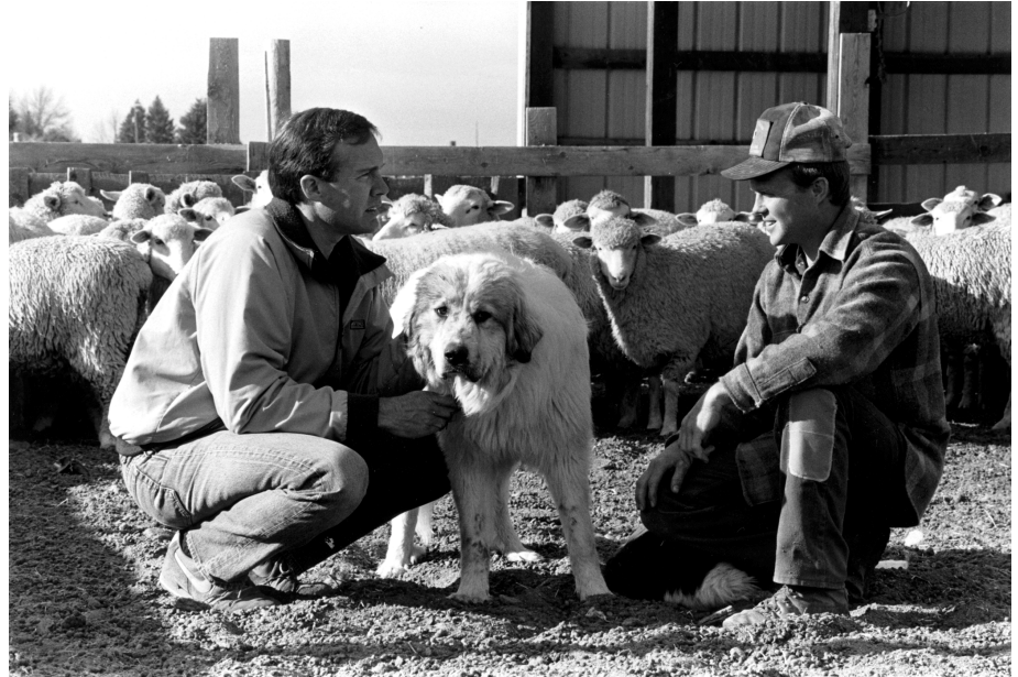
Wildlife Services specialists can provide information and guidance to the dog owner.

Dogs may be viewed as a first line of defense against predators in many operations. Their effectiveness can be enhanced by good livestock management and by eliminating persistent depredated predators with suitable removal techniques.