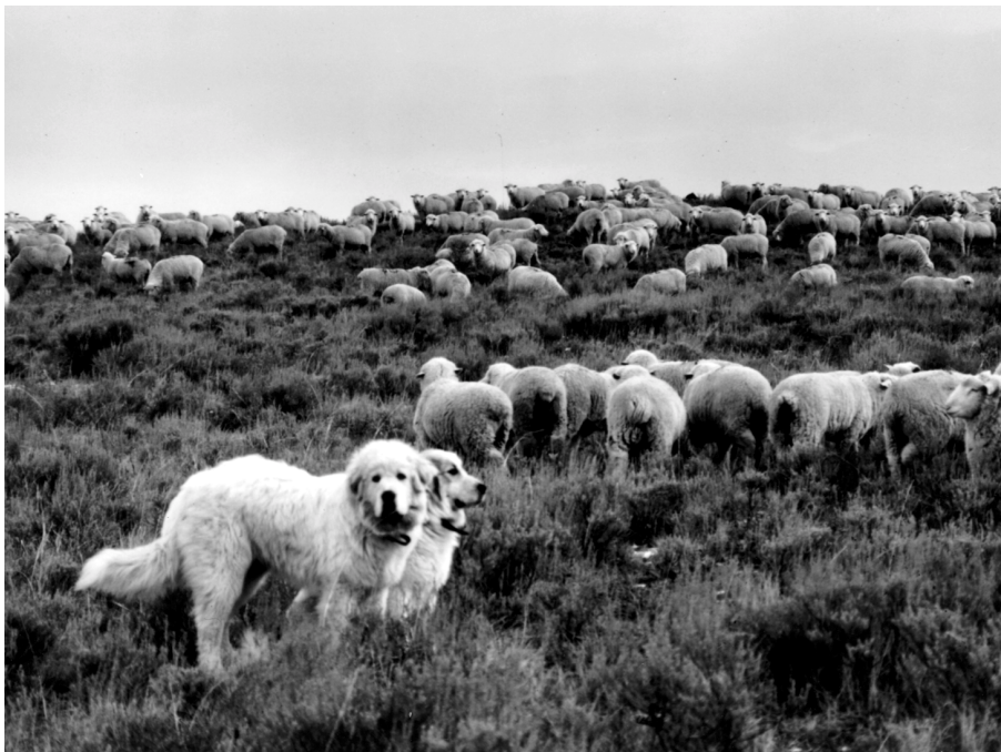
To protect large numbers of sheep on open rangeland or pastures, more than one dog may be required. These two Great Pyrenees guard a large rangeland flock.

More than 80 percent of the people who raise sheep in the United States maintain their flocks in fenced pastures during all or part of the year. This