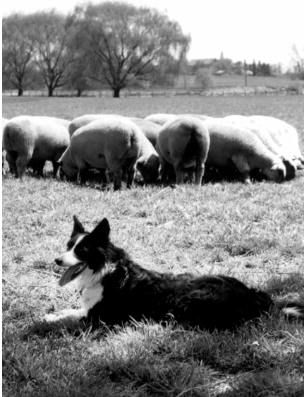
This border collie, a herding dog, is bred to “bunch” and move sheep from one area to another on command from its owner.

It is important to understand the distinction between herding dogs and guarding dogs. Herding dogs (border collies, Australian shepherds, and others) move sheep from one area to another by biting, chasing, or barking at the sheep. Herding dogs work according to signals (verbal and hand) from a handler, and they are generally not left alone with the sheep. Guarding dogs usually do not herd sheep, are discouraged from biting, chasing, and barking at sheep, and act independently of people. (Also see section on “Interactions Between Herding and Guarding Dogs.”)