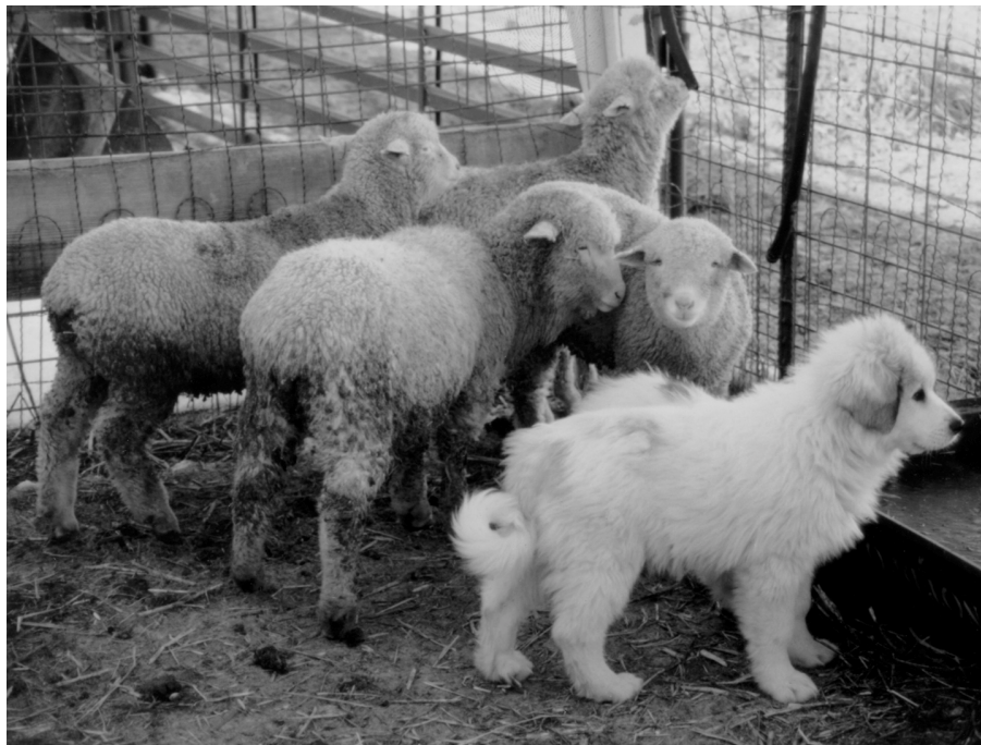
Rearing this Great Pyrenees pup with sheep creates a bond that will be important in determining the dog's future success as a protector.

The ideal place to rear a pup is in a small pen or corral from which it cannot escape. A pup that has been removed recently from littermates and the frequent association of humans may not want to remain in a pen with lambs. If the pup is able to leave its designated area, the inclination of the pup to escape and return to the kennel, home, and people becomes progressively stronger. If the pup is unable to escape, the bond with sheep may develop more