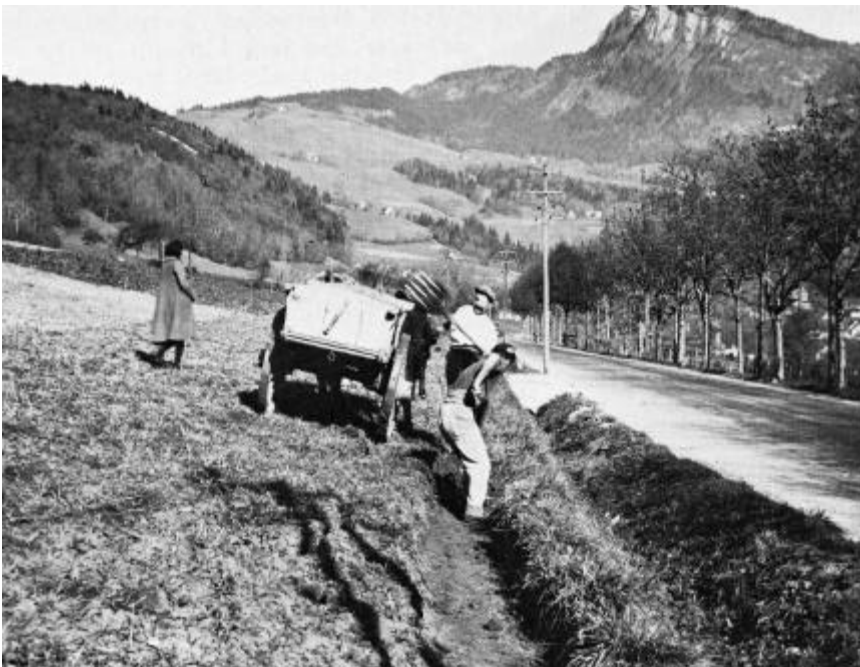
FIGURE 12.—These French farmers are digging up the soil along the lower furrow of their field and loading it into a cart. It will be hauled uphill and spread along the upper edge. They do this job each winter to help compensate for the downhill movement of soil by erosion.

were built on the contour to form level benches. At other places, farmers dug up the soil of the bottom furrow of their fields that were laid out in contour strip crops, loaded the soil into carts, hauled it to the upper edges of the fields, and dumped it along the upper contour furrows to compensate for downslope movement of soil under the action of plowing and the wash of rain (fig. 12). This was done each year. Where the slope was too steep to haul the soil uphill, they loaded the soil of the bottom furrow in baskets and carried it on their backs to the upper edges of the field. In this way these farmers of France take care of their soil from generation to generation.