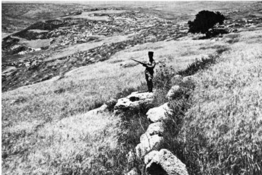
FIGURE 3.—This is a present-day view of a part of the Promised Land to which Moses led the Israelites about 1200 B. C. A few patches still have enough soil to raise a meager crop of barley. But most of the land has lost practically all of its soil, as observed from the rock outcroppings. The crude rock terrace in the foreground helps hold some of the remaining soil in place.

Where soils are held in place by stone terrace walls, that have been maintained down to the present, the soils are still cultivated after several thousand years. They are still producing, but not heavily, to be sure, because of poor soil management (fig. 3).