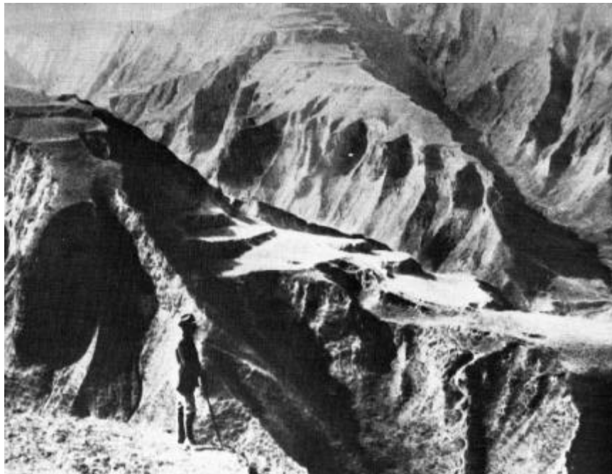
FIGURE 8.—These huge gullies indicate the severity of soil erosion in the deep, and once fertile loessial soils of northern China. Millions of acres have been cut up like this and are now almost worthless.

Let's now go back and follow the westward course of civilization from the Holy Lands through North Africa and on into Europe. In Cyprus we found the land use problems of the Mediterranean epitomized in a comparatively small area.