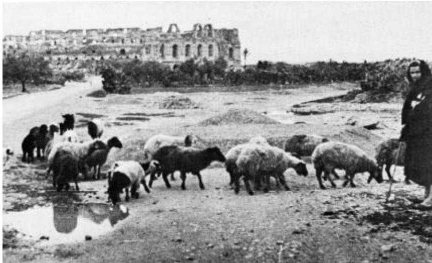
FIGURE 10.—Ruins of the amphitheater at the former city of Thysdrus, in Tunisia, which would seat 60,000 people. Today, only a few thousand people inhabit this area. The small flock of sheep in the foreground are a fair indication of the land's ability to support life.

So Director Hodet of the Archaeological Excavations at Timgad decided as an experiment to plant olive trees on an unexcavated part of the city where there would be no possibility of subirrigation. He planted young olive trees in the manner prescribed in Roman literature, watering them in the following two long dry summer seasons. These olive trees are thriving, indicating that where soils are still in place, olive trees will grow today probably very much as they did in Roman times.