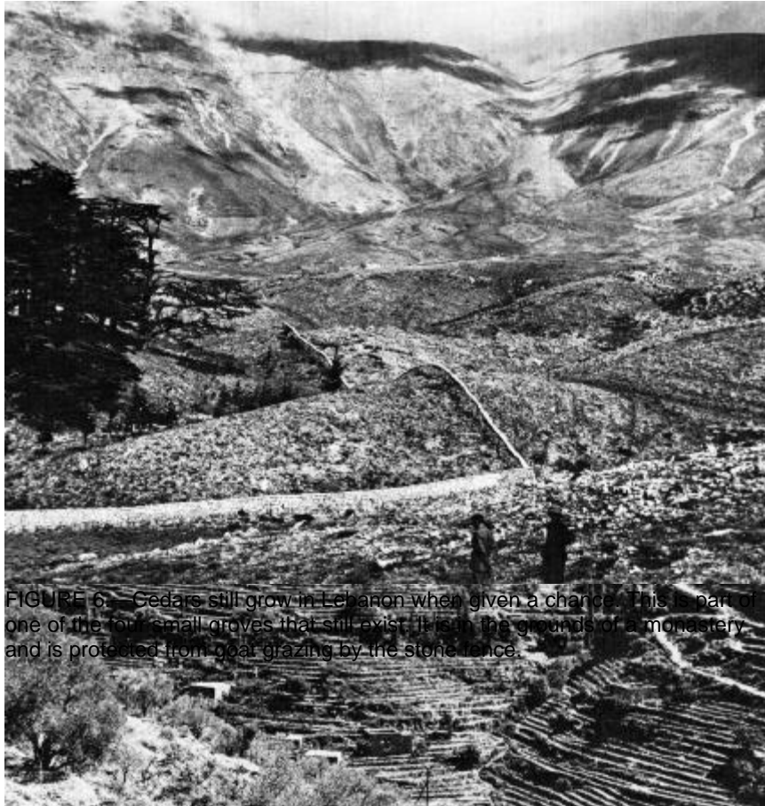
FIGURE 6.—Cedars still grow in Lebanon when given a chance. This is part of one of the few small groves that still exist. It is on the grounds of a monastery and is protected from goat grazing by the stone fence.

caused the soil to shift down slope. As the fine-textured soil was washed away, leaving loose rocks at the surface, tillers of the soil piled the rocks together to make cultivation about them easier. In these cases the battle with soil erosion was definitely a losing one.