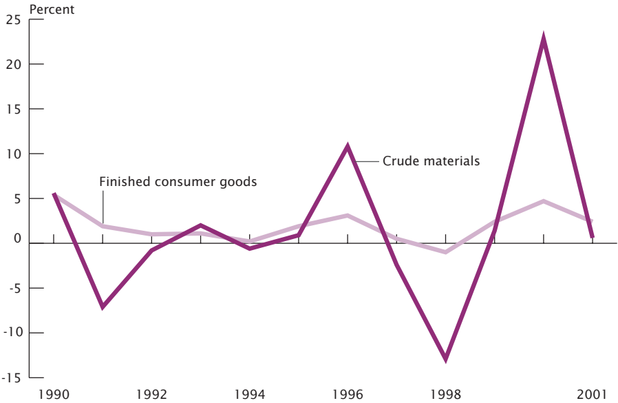
Figure 14.2 Annual Percent Change in Producer Price Indexes by Stage of Processing: 1990 to 2001

Source: Chart prepared by U.S. Census Bureau. For data, see Table 686.