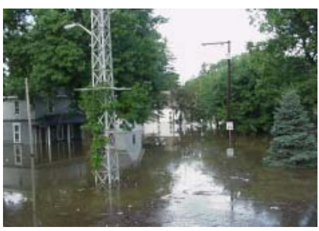
Five structures were removed from this Kokomo, Indiana area as a result of the buy out.

With the planning and experience gained in the initial phases, city leaders look forward to a smooth process in the next phase as they apply for HMGP funds to continue their flood hazard mitigation plan. The city's vision of a creek-side green space with a floodwater-holding retention pond, park and walking path to replace the deteriorating, unsafe flood-damaged houses is getting much closer to being a reality.