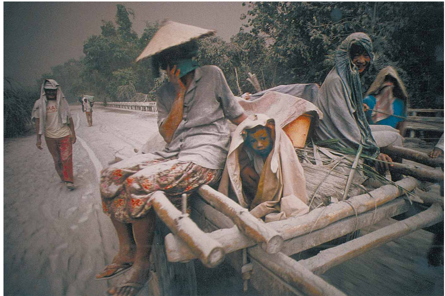
Villagers fleeing the vicinity of Mount Pinatubo, Philippines, during heavy ash fall from the volcano's cataclysmic June 15, 1991, eruption. Scientists from the Philippine Institute of Volcanology and Seismology and the U.S. Geological Survey forecast this eruption, enabling people living near the volcano to evacuate to safety. The timely forecasts of these scientists saved at least 5,000 lives and prevented property losses of at least $250 million.

The climactic June 1991 eruption of Mount Pinatubo, Philippines, was the largest volcanic eruption in this century to affect a heavily populated area. Because it was forecast by scientists from the Philippine Institute of Volcanology and Seismology and the U.S. Geological Survey, civil and military leaders were able to order massive evacuations and take measures to protect property before the eruption. Thousands of lives were saved and hundreds of millions of dollars in property losses averted. The savings in property alone were many times the total costs of the forecasting and evacuations.