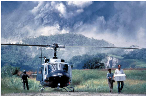
Scientists from the U.S. Geological Survey and the Philippine Institute of Volcanology and Seismology making emergency repairs to monitoring instruments on Mount Pinatubo, Philippines, with U.S. Air Force helicopter support, the day before the volcano's cataclysmic June 15, 1991, eruption.

The USGS and PHIVOLCS estimate that their forecasts saved at least 5,000 lives and perhaps as many as 20,000. The people living in the lowlands around Mount Pinatubo were alerted to the impending eruption by the forecasts, and many fled to towns at safer dis-