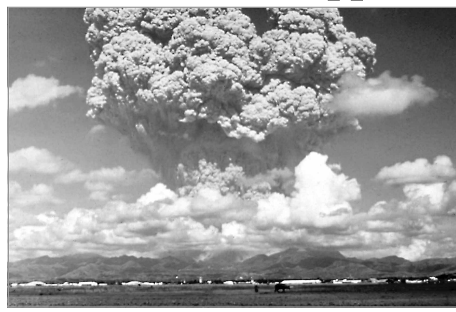
A huge cloud of volcanic ash and gas rises above Mount Pinatubo, Philippines, on June 12, 1991. Three days later, the volcano exploded in the second-largest volcanic eruption on Earth in this century. Timely forecasts of this eruption by scientists from the Philippine Institute of Volcanology and Seismology and the U.S. Geological Survey enabled people living near the volcano to evacuate to safer distances, saving at least 5,000 lives.

On July 16, 1990, a magnitude 7.8 earthquake (comparable in size to the great 1906 San Francisco, California, earthquake) struck about 60 miles (100 kilometers) northeast of Mount Pinatubo on the island of Luzon in the Philippines, shaking and squeezing the Earth's crust beneath the volcano. At Mount Pinatubo, this major earth-