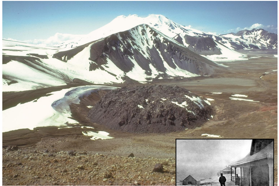
Today, the blocky lava dome of Novarupta sits in the ash-and-debris-filled volcanic crater, more than a mile wide, created by a cataclysmic 1912 volcanic eruption that rained ash over southern Alaska, western Canada, and the Pacific Northwest. Snow-capped Mount Mageik, another potentially explosive volcano in Katmai National Park, can be seen in the background. Inset shows a resident of the devastated village of Kodiak, 100 miles southeast of Novarupta, standing in deep drifts of ash shortly after the June 1912 eruption.

Similar conditions prevailed elsewhere in southern Alaska, and several villages were abandoned forever. Animal and plant life was decimated by ash and acid rain from the eruption. Bears and other large animals were blinded by ash and starved