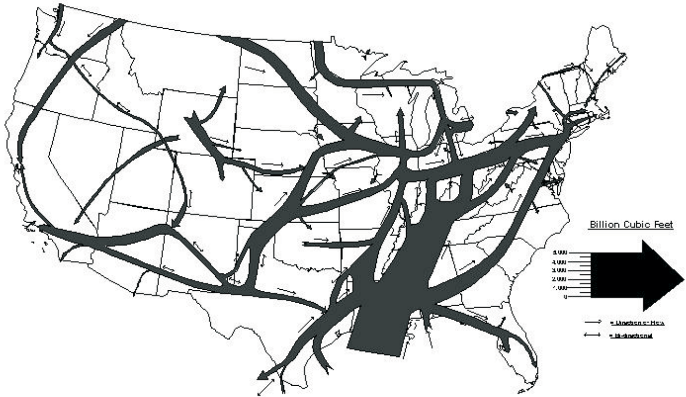
Figure 7. Principal Interstate Natural Gas Flow Summary, 2002