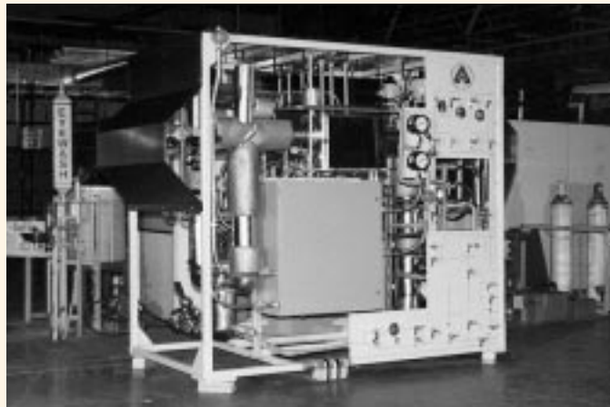
Field fouling unit for refinery experiments.