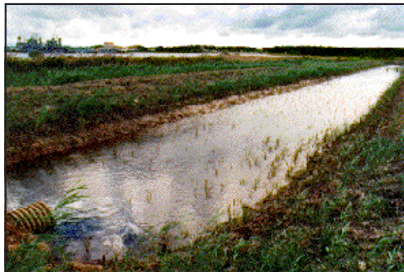
Tidal wetland at NAB Little Creek, Virginia. Constructed Fall 1996.

Cost Effective Treatment of Non-Point Source Pollution