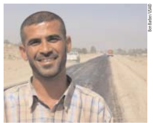
An Iraqi manager of the company which built a seven-mile road under a U.S.