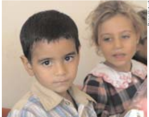
Children at a kindergarten in Basrah. The school was refur-