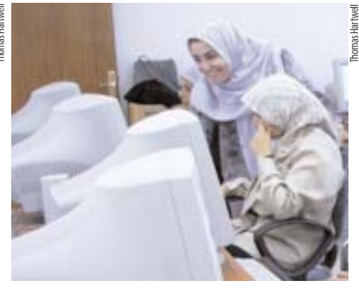
Young Iraqis practice their computer skills at a women's center south of Baghdad. The