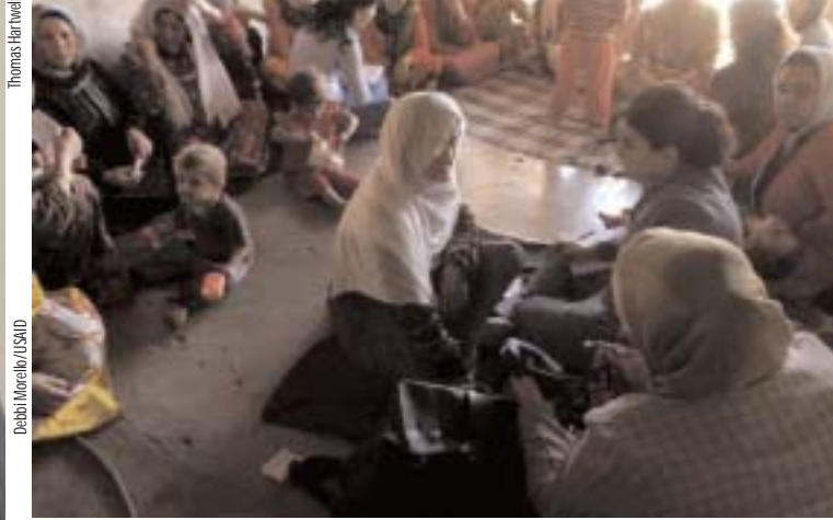
USAID grants funded mobile health clinics to serve thousands of women in remote villages in northern Iraq.

"Health care spending in Iraq has increased to 60 times pre-liberation levels. Two hundred and forty Iraqi hospitals and more than 1,200 primary health centers are operating and have been since last summer. More than 30 million doses of children's vaccine have been distributed."