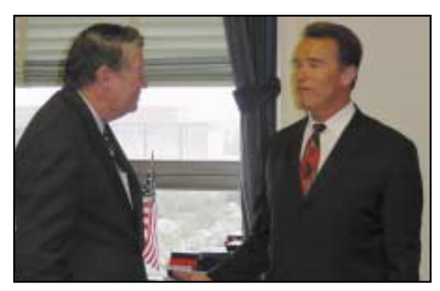
Duke and Arnold share ideas on how Congress can continue to improve education.

Impact Aid funding for schools serving military and Native American children is increased to $1.238 billion, which is a $50 million increase over last year's level and $223 million above the budget request. Since 1995, the Republican Congress has increased Impact Aid by over $500 million. These dollars help to educate the children of our fighting forces who are stationed at our military installations. Because so many military operations are located in the San Diego area, our region is a major beneficiary of this critical national program.