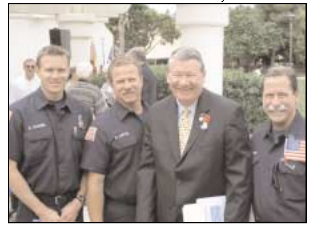
Cunningham with members of the Solana Beach Fire Department to discuss Congress' role in readiness and terrorism response policies