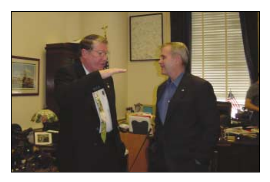
Cunningham and Oliver North discuss the War in Iraq.

Since 2001, Congress has spent more than $20 million on local first responders. While the Department of Homeland Security has the lead in developing our national homeland security strategy, implementation of the strategy requires the active participation of state and local governments and the private sector. Cunningham has worked tirelessly to bring first responder funds to San Diego to assist our local police and sheriff in their broadened mission to protect San Diego from terrorism.