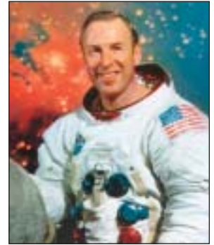
Capt. James Lovell, Jr.

Joining the congressman in bringing the compact disc entitled “Voices from Home” to