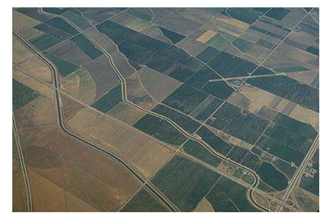
Farmland in the Central Valley

Numerous crops within the San Joaquin Valley are dependent on methyl bromide to fumigate soil before planting and for post-harvest commodity treat-