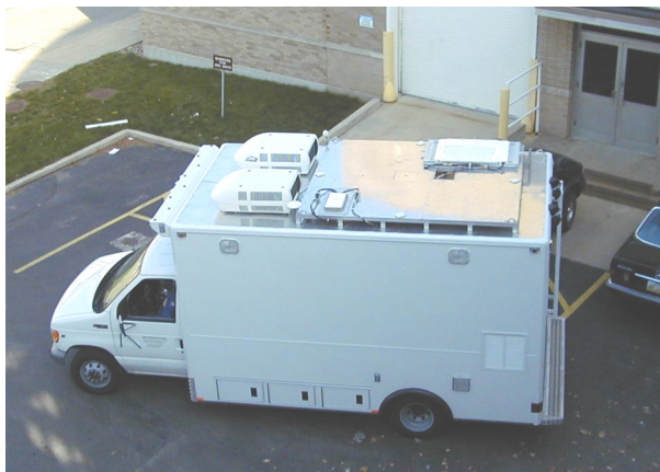
Figure 4 – Ku Band aero mobile satellite communications terminal mounted in the ground mobile van.

The aero mobile terminal has been designed to be mounted either in a van for ground mobile experiments or in a NASA research aircraft for air mobile experiments. The ground mobile terminal van, with transmit and receive phased array antennas mounted on top, is shown in Figure 4. In the ground mobile configuration, a gyro system is used to feed inertial navigation information to the antenna controller to enable antenna pointing to be maintained during mobile operations. For the air mobile configuration, connection to the aircraft's inertial navigation system provides the navigation information required for antenna pointing.