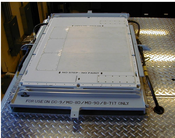
Figure 3 – Ku Band receive phased array antenna.

such as Ka Band (20-30 GHz), enables reduced antenna size, but requires more technology development. NASA Glenn has sponsored technology development work, jointly with the U.S. Navy and the Boeing Company, to develop a phased array transmit antenna at Ku Band (12 GHz). This antenna, and a receive phased array antenna at Ku Band (14 GHz) which had been previously developed, form the core the NASA Glenn's aero mobile satellite communications terminal described below. These antennas are shown in Figures 2 and 3.