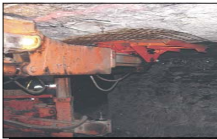
Continuous operator protection can be supplied by overlapping screens on cycle.

A PBS is a smaller sheet of wire screen (5x5 ft, with 4x4 inch openings, 8 gage wire) that weighs 11 lbs and can easily be handled by one person. It is easy to install with twin-boom (non walk-thru) bolters in mid-lower height coal seams.