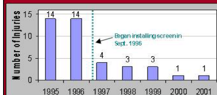
Screening can significantly reduce injury rates.