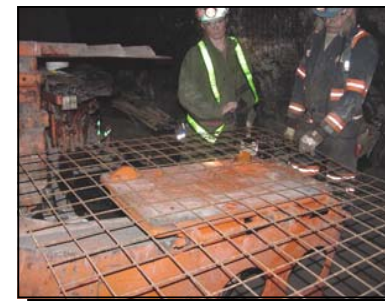
The PBS protects not just roof bolters but also continuous miner operators and others who will subsequently work or travel in the area.