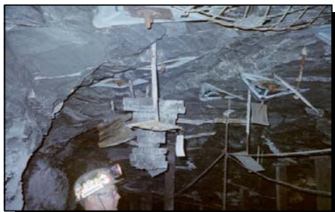
98% of roof fall injuries are due to small rock falls between supports.

Installation of welded wire screen can be very effective in reducing roof fall injuries. When installed on cycle, screen provides immediate protection to roof bolters.