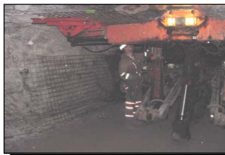
NIOSH trial installations indicate that the PBS can be installed much faster than a full screen, and it is easier to handle and store.