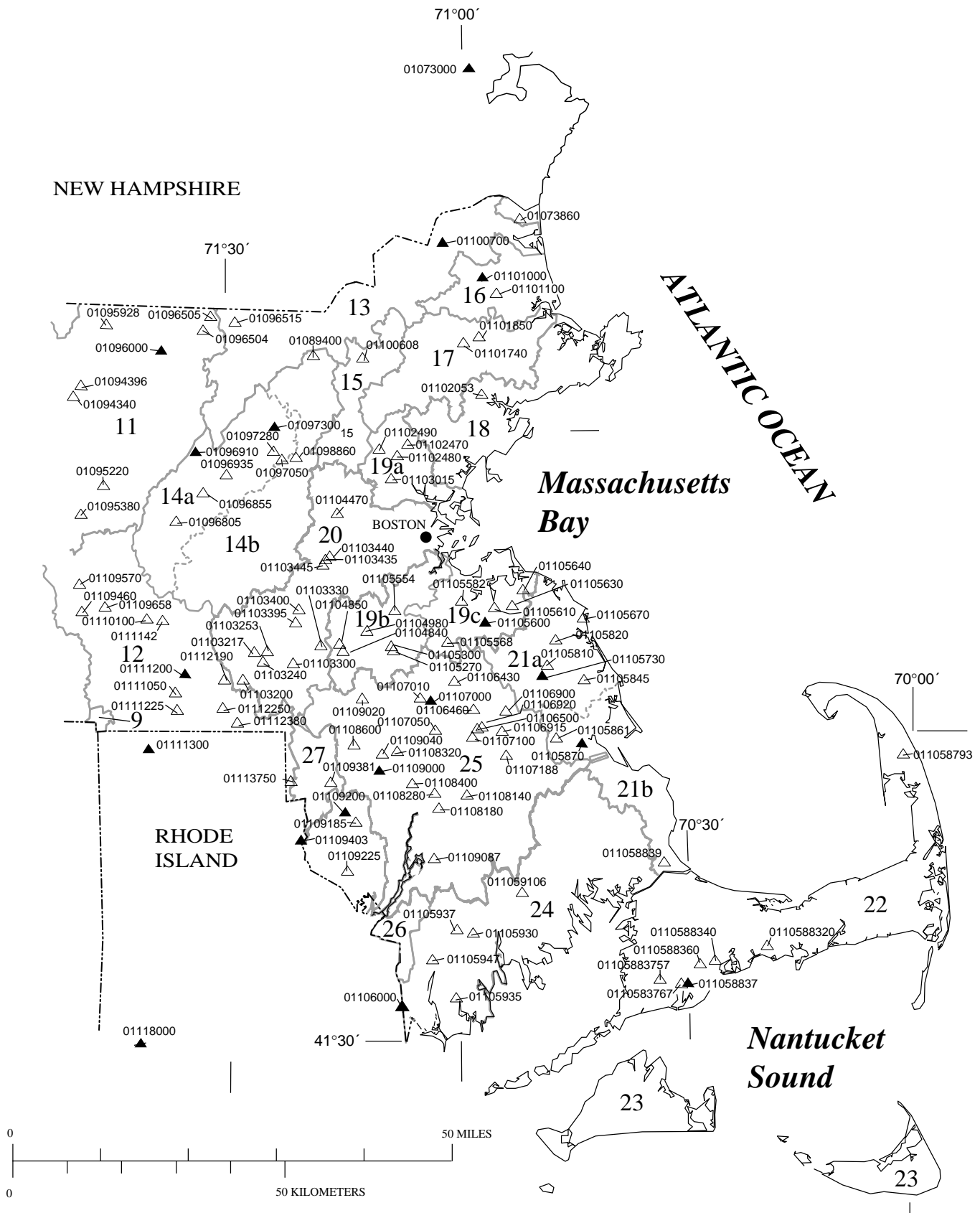
Figure 1. —Continued.