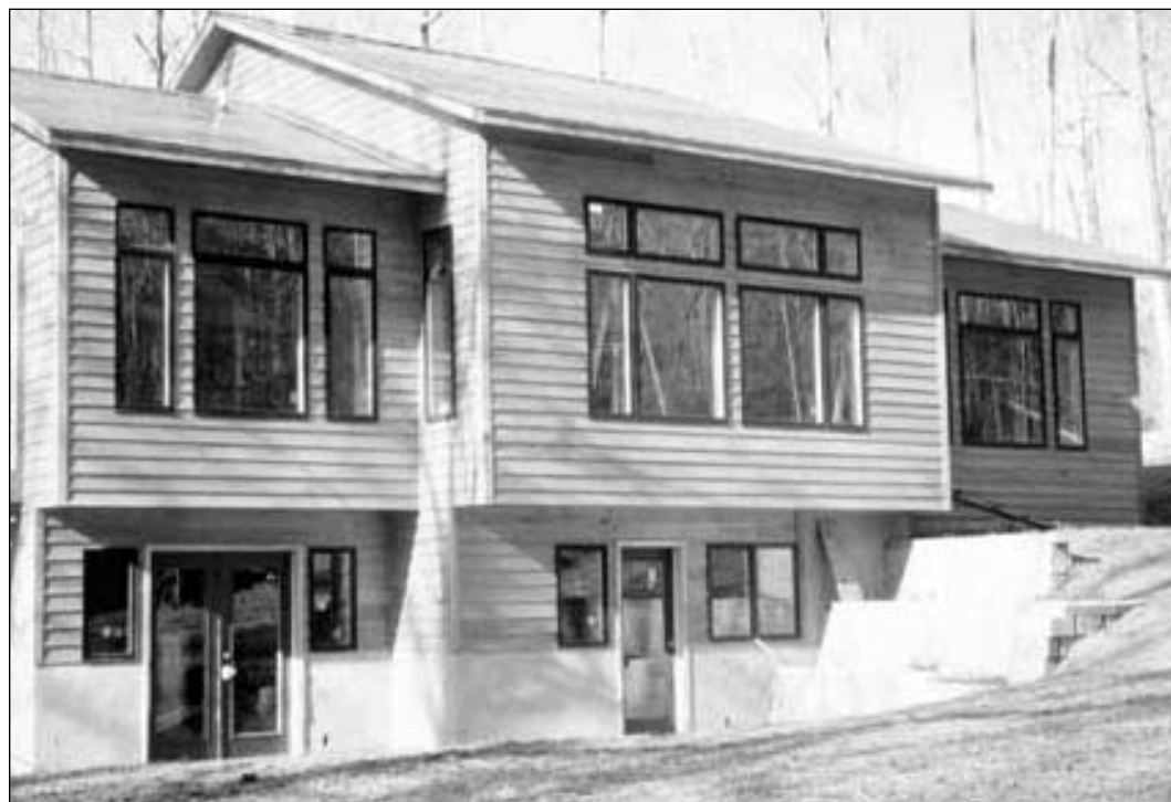
This house in North Carolina features a passive solar design.