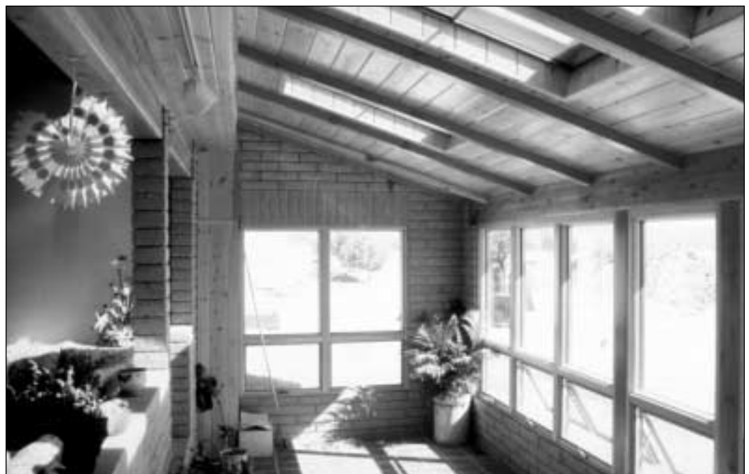
A sunspace within a home in Minden, Nevada.

Most successful passive solar homes are very airtight. As a result, they may require mechanical ventilation systems to main-