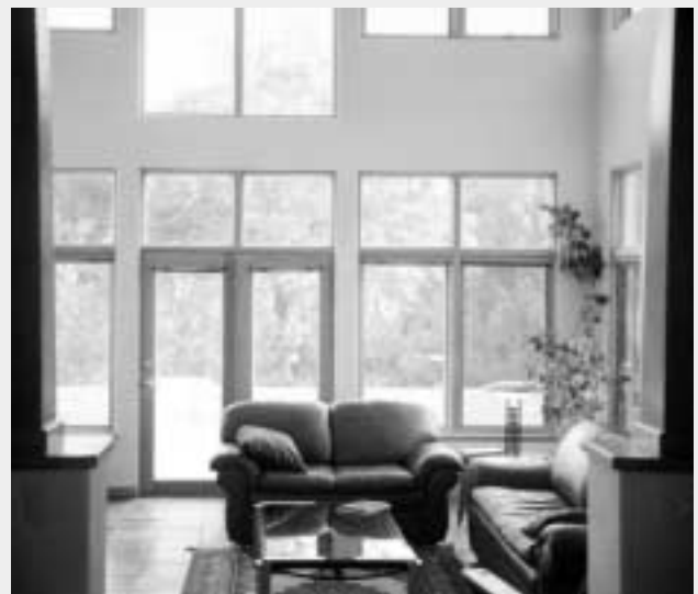
Nancy Carlisle, NREL/PIX02778

As you can see, selecting windows can be complicated. That's why it's best to have an experienced solar design professional use a simulation tool to determine the best windows to use in your home's climate.