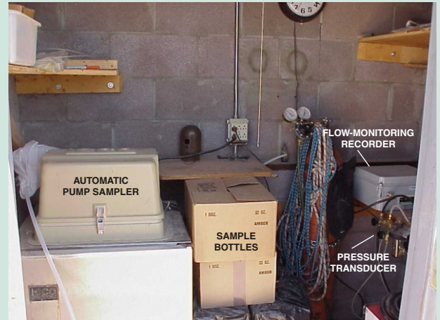
Instrumentation in shelter.

Mean daily flow has been published annually in USGS Water-Data Reports for the North Floodway Channel near Alameda site (UR 9900) since 1968 and for the South Diversion Channel above Tijeras Arroyo site (UR 200) since 1988. At most sampling sites, only flow hydrographs for the storms sampled are available because the flow-monitoring recorder has to be reset at the beginning of each flow. The flow recorders at all sites with permanent shelters are gradually being upgraded so that incremental flow for all storms can be monitored.