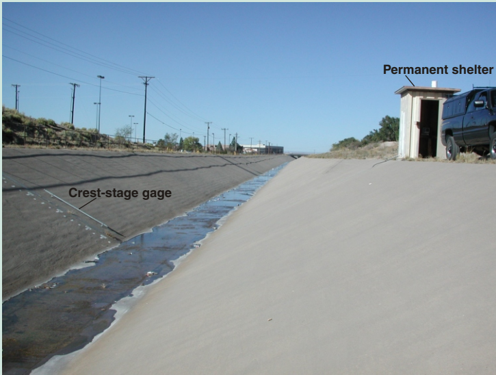
North Floodway Channel near Alameda gaging station.