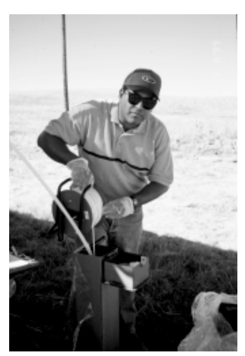
Water levels are sometimes measured in the monitoring wells during and after sampling to see if the aquifer water level has decreased in the vicinity of the well during pumping.

The December biosolids sample will be submitted to the USGS laboratories for chemical analysis. A quarterly sample of biosolids material will be collected, dried, and prepared for analysis. All data obtained from the program to date