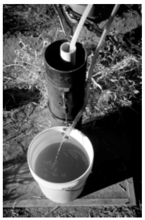
Water standing in the well is always pumped out before sampling. This water is called "purge water" and can be quite murky, as at well D29.

USGS made 5 presentations related to this project to various groups of stakeholders: the Upper South Platte Watershed Association in Limon, Colo. (September 30, 1999), USGS colleagues in Sacramento, Calif. (November 17, 1999), Colorado USGS management in Denver, Colo. (November 22, 1999), Deer Trail Soil Conservation District (SCD) in Deer Trail, Colo. (November 23, 1999), and Agate SCD in Agate, Colo. (December 1, 1999).