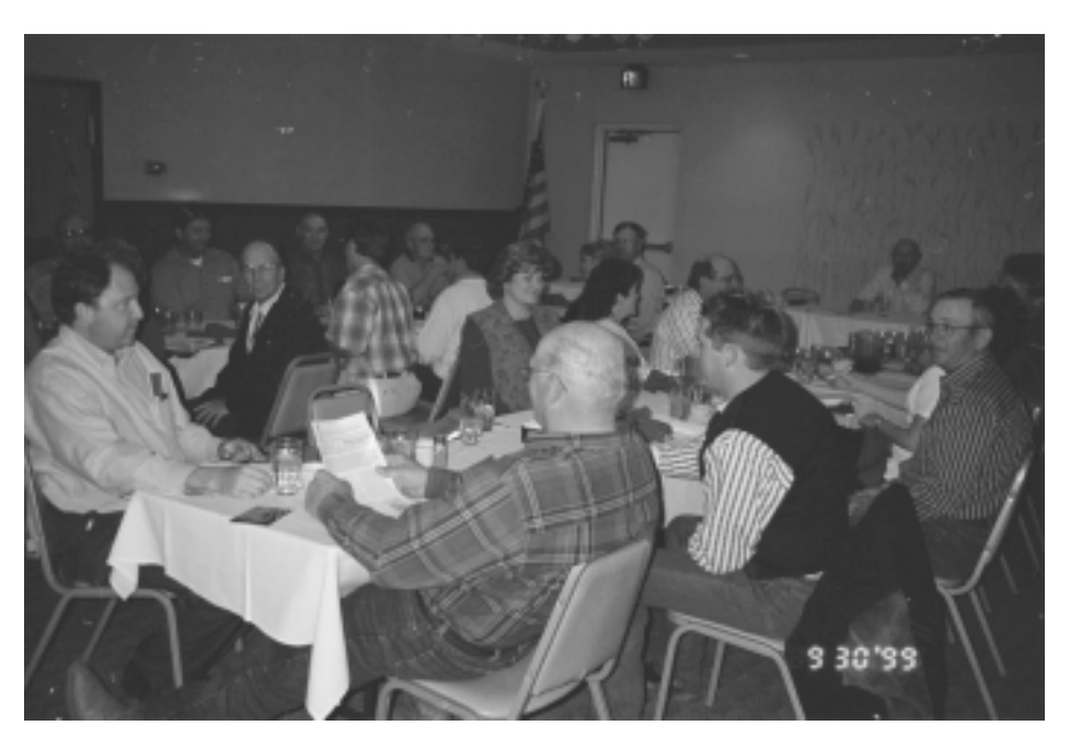
USGS made a number of presentations related to this program. One such presentation was made to the Upper South Platte Watershed Association meeting in Limon, Colorado, the evening of September 30,

Ground-water levels were measured October 4, November 3, and December 1, 1999. Ground water was sampled for chemistry November 8-17, 1999. Ground-water data were compiled and reviewed. All equipment, computers, and databases were checked for Y2K compliance; no problems were found.