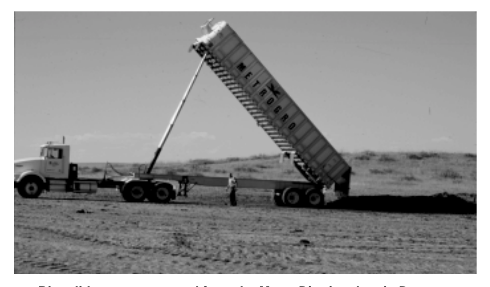
Biosolids are transported from the Metro District plant in Denver, Colorado, to the Metro District properties near Deer Trail, Colorado, in large trucks. At the Metro District farm, biosolids are emptied from the trucks then transferred into spreader vehicles that apply the biosolids to the fields.