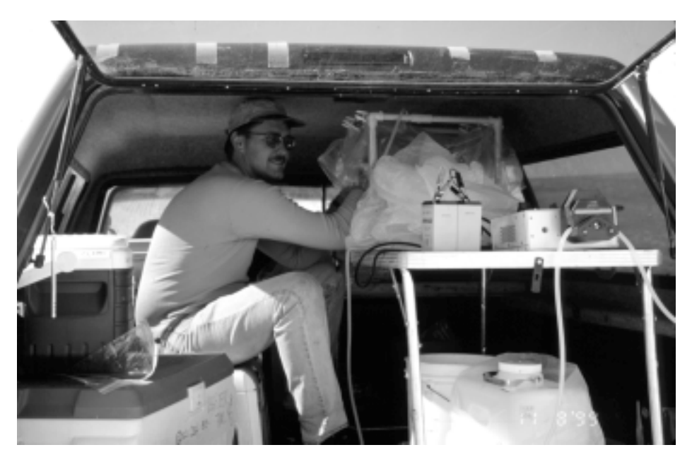
Ground water is pumped into USGS vehicles for processing to minimize wind-born contamination and to keep the samples out of sunlight.

Ground-water levels will be measured the first week of each month. Ground water will be sampled in early January, weather permitting. All data obtained from the program to date will be compiled, reviewed, and evaluated. The first annual report will be planned and written.