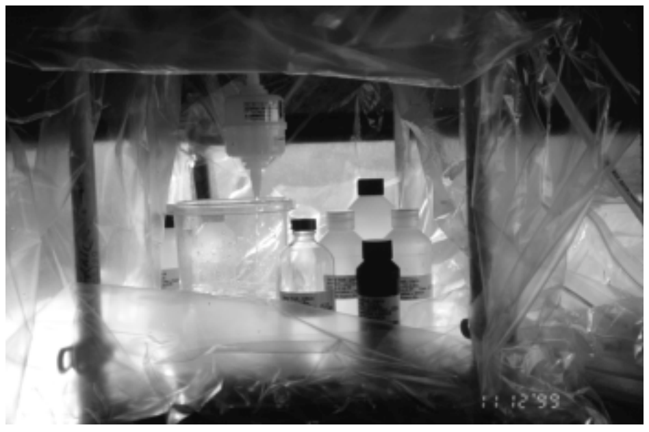
Bottles of ground-water sample are filled and processed (including filtering) inside a special "clean room" chamber inside the truck to further minimize contamination.