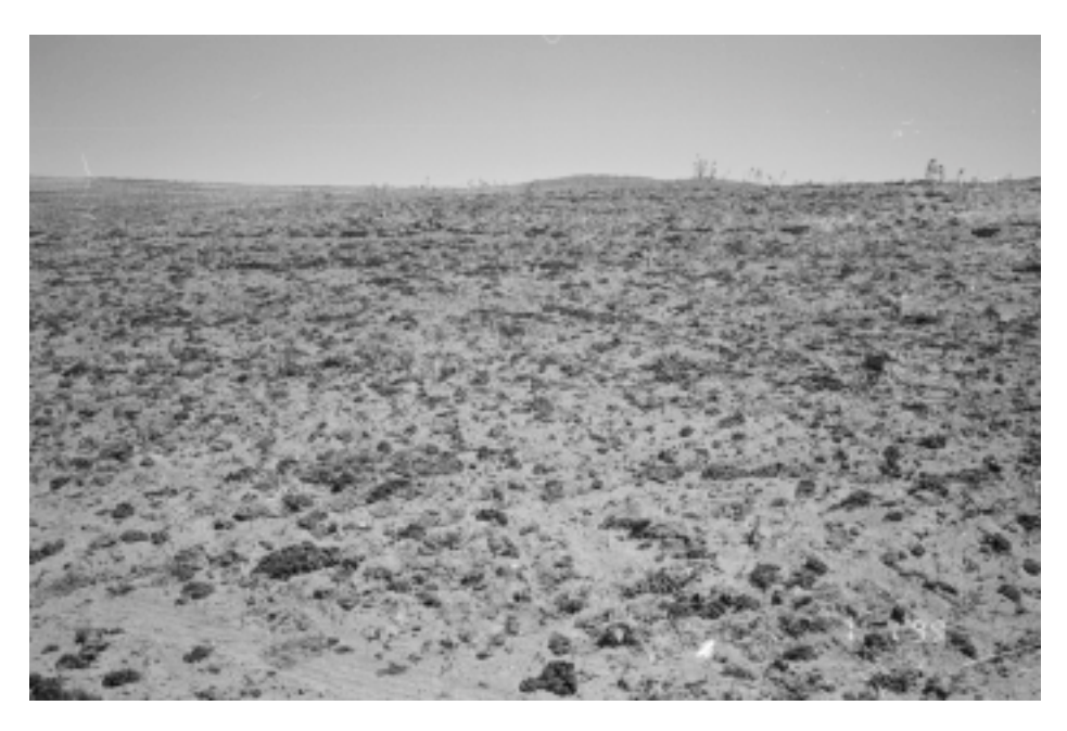
Biosolids (which show as dark clumps in the above photo) are sprinkled on the Metro District farm fields, not applied as a thick cover. Application rates are determined by soil properties and expected uptake of nutrients by the crop that will be grown on the field.