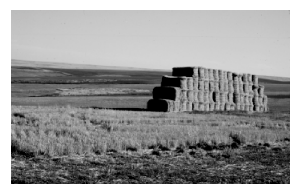
Crops from each of the six 20-acre (soil monitoring) fields will be chemically analyzed after harvest later in 2000.

The quarterly composite sample of biosolids was received from the Metro District on December 2, 1999. The sample was a 24-hour